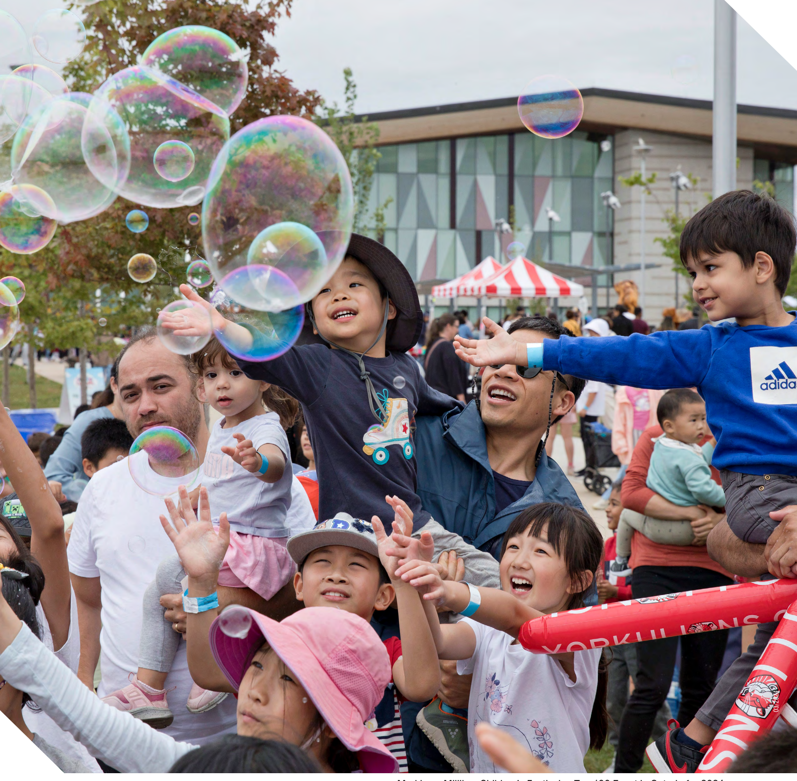
Markham-Milliken Children's Festival, a Top 100 Event in Ontario for 2024, took place outside of Aaniin Community Centre on September 9, 2023.