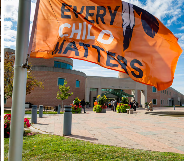
Canada Day celebration (left); Standing in the Doorway exhibition at Markham Museum (middle); Every Child Matters flag was raised at Markham Civic Centre in recognition of the National Day for Truth and Reconciliation and Orange Shirt Day (right).