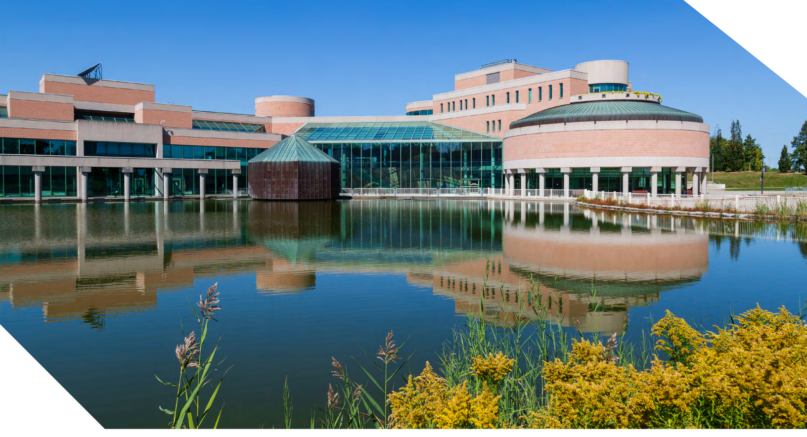
Markham Civic Centre and reflection pond.