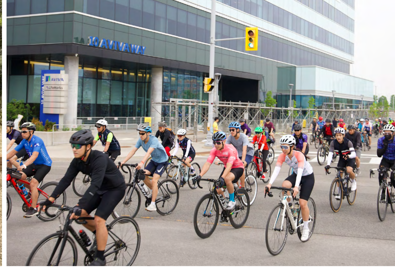
Austin Dr. Mini Forest tree planting (left); and 2023 Markham Cycling Day (right).