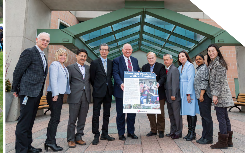
Markham Centre Trails (left); and Markham signed municipal Housing Pledge on March 22, 2023 (right).