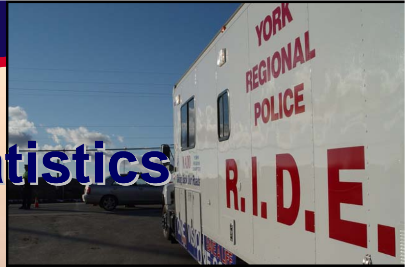
Traffic Bureau R.I.D.E. Stats Comparison