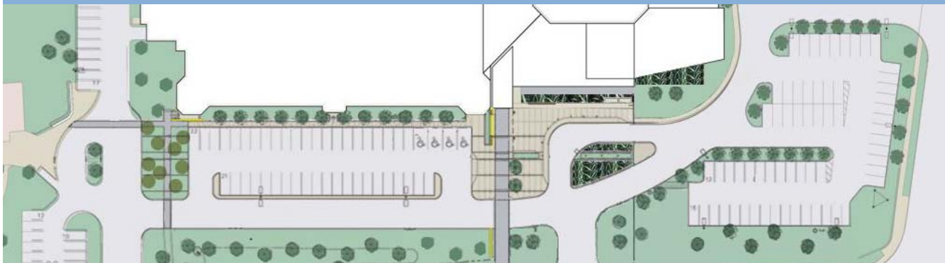
New Site Plan