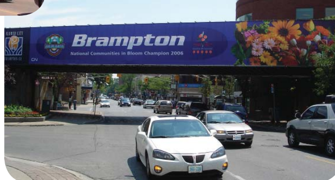
After - North Facing - Summer