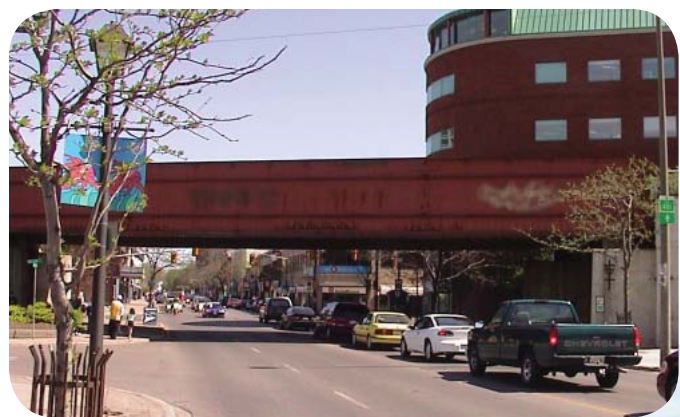
Before - North Facing