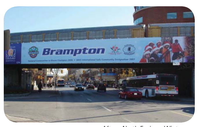
After - North Facing - Winter