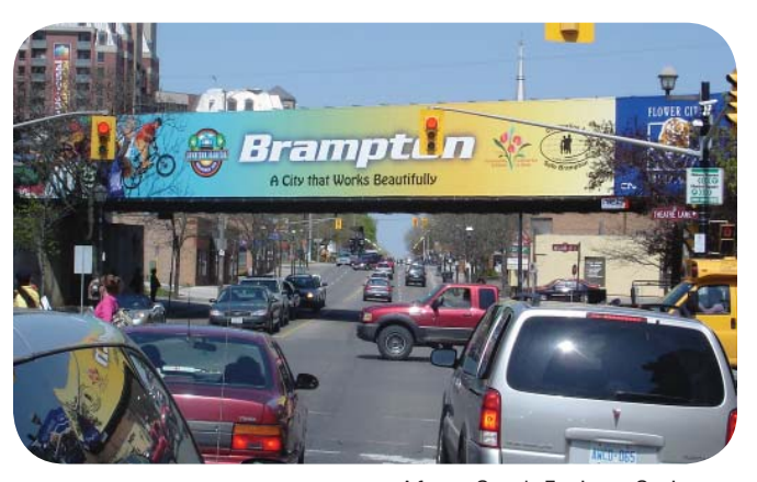
After - South Facing - Spring