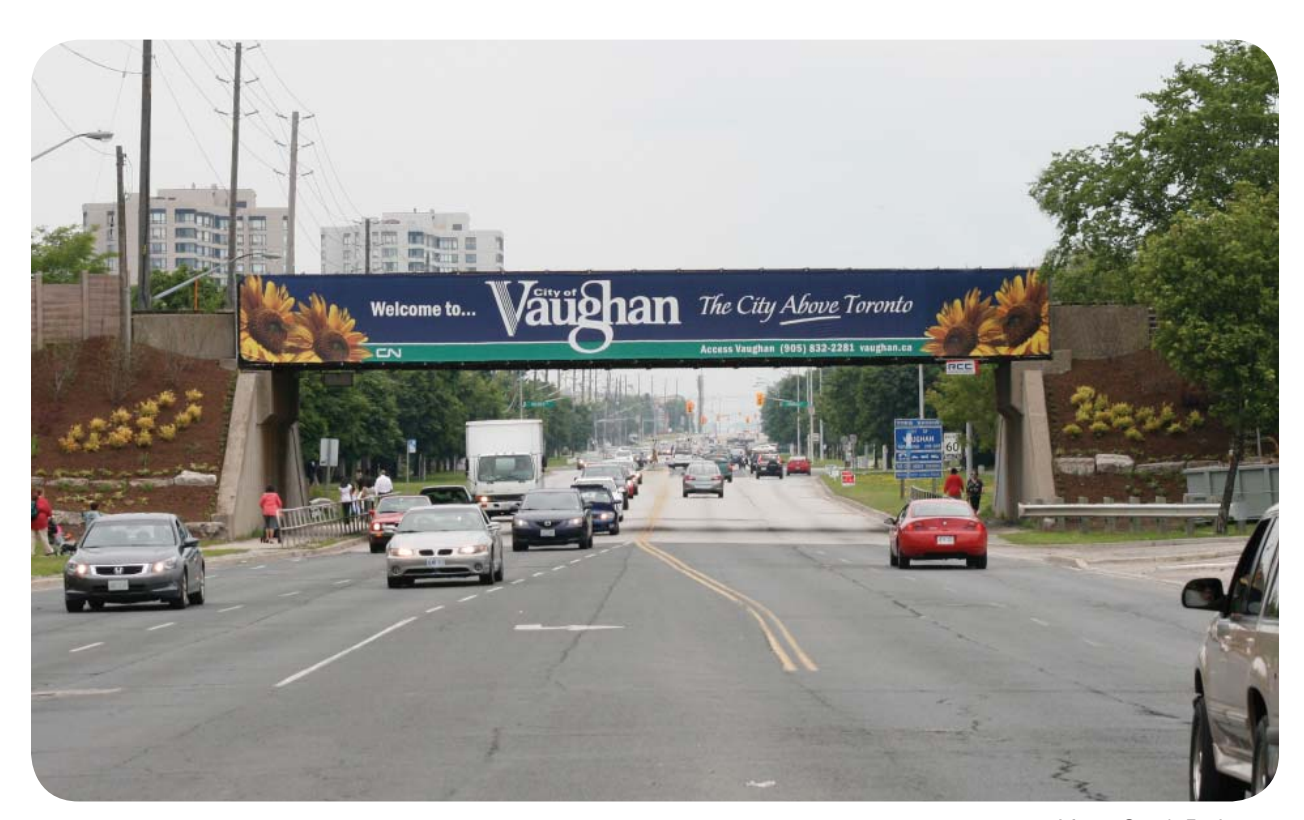
After - South Facing