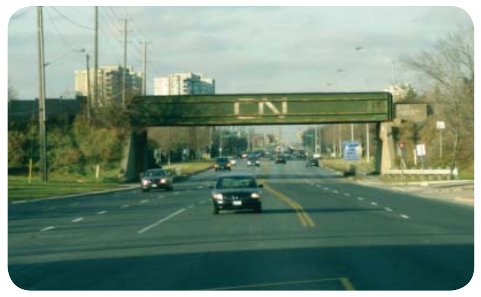
Before - South Facing