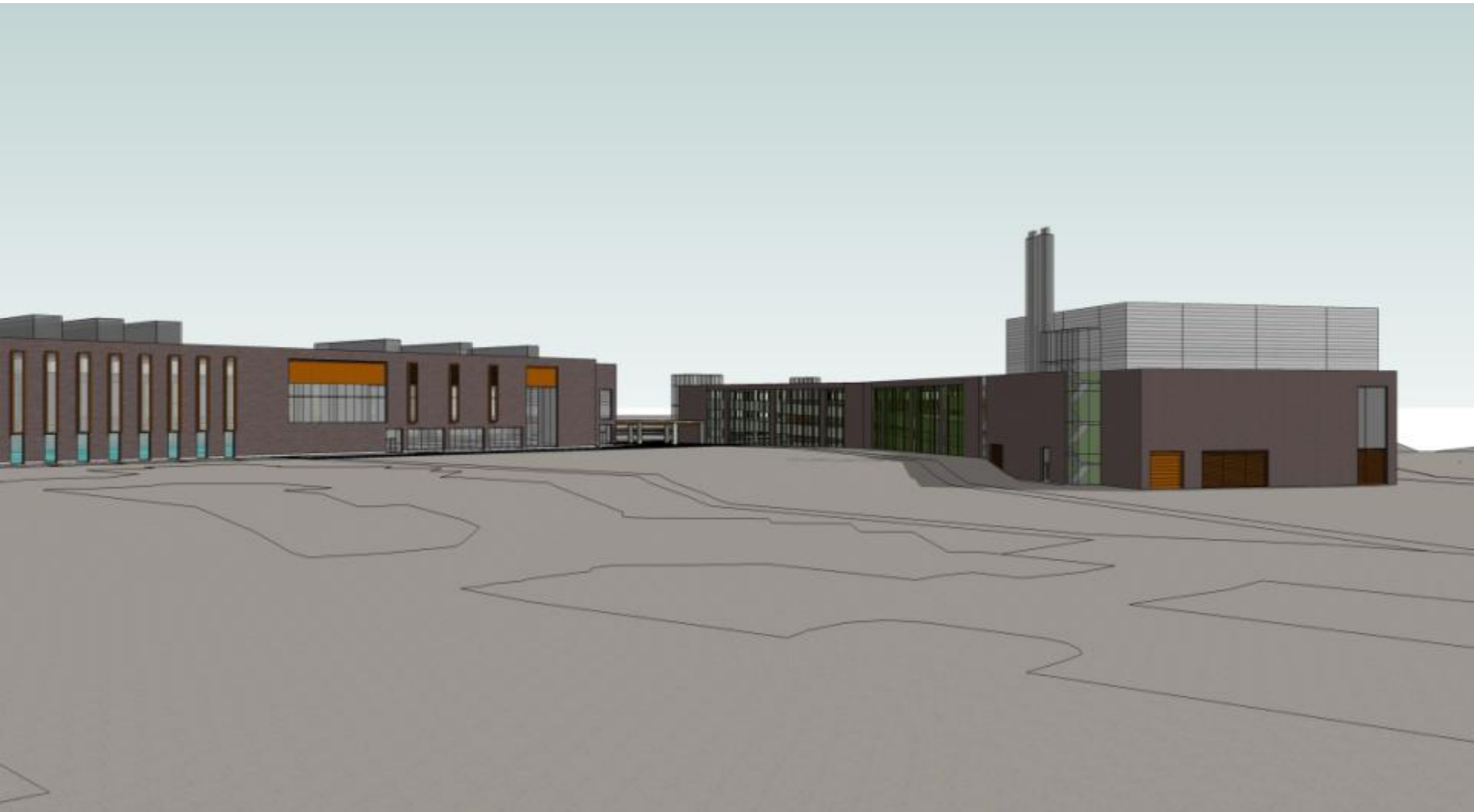
MDE Plant- view from northwest