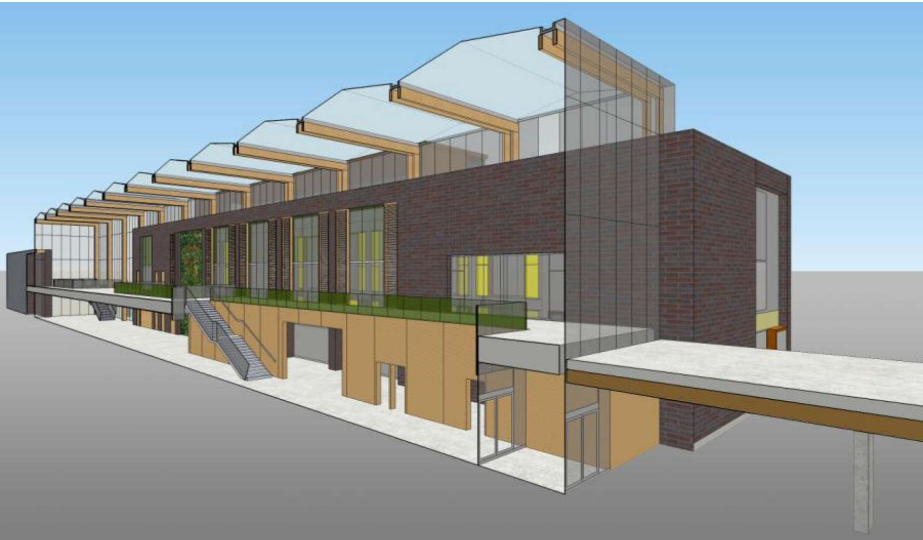
Common Space Skylight- current design