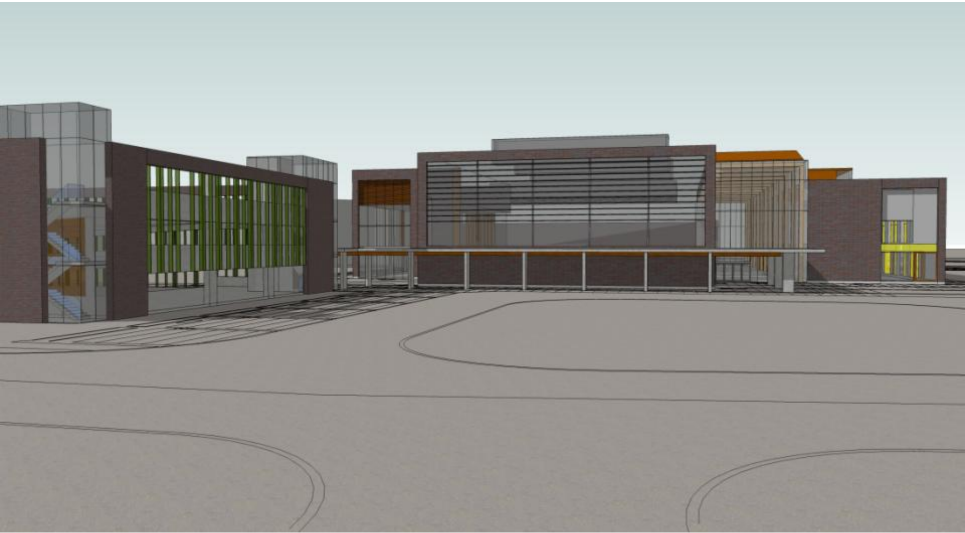
Parking Structure- view from south drop off court