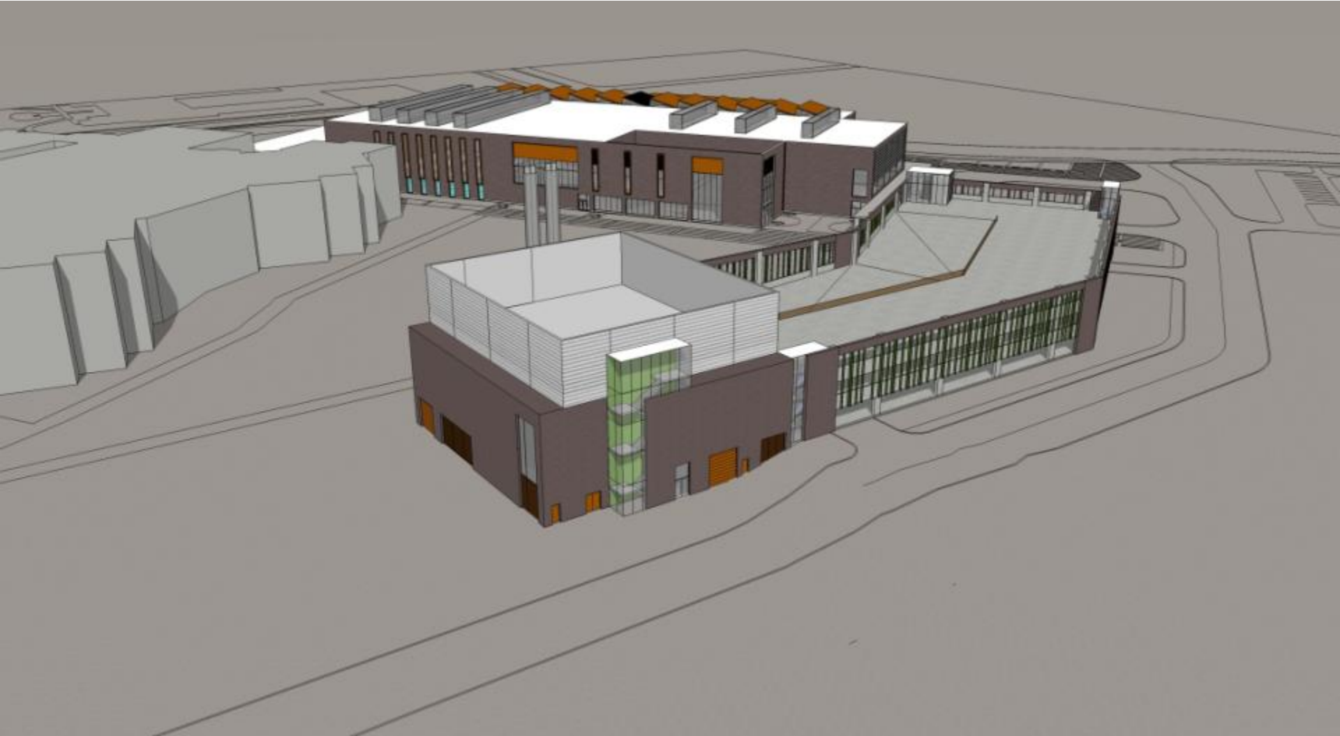
MDE Plant- aerial view from southwest