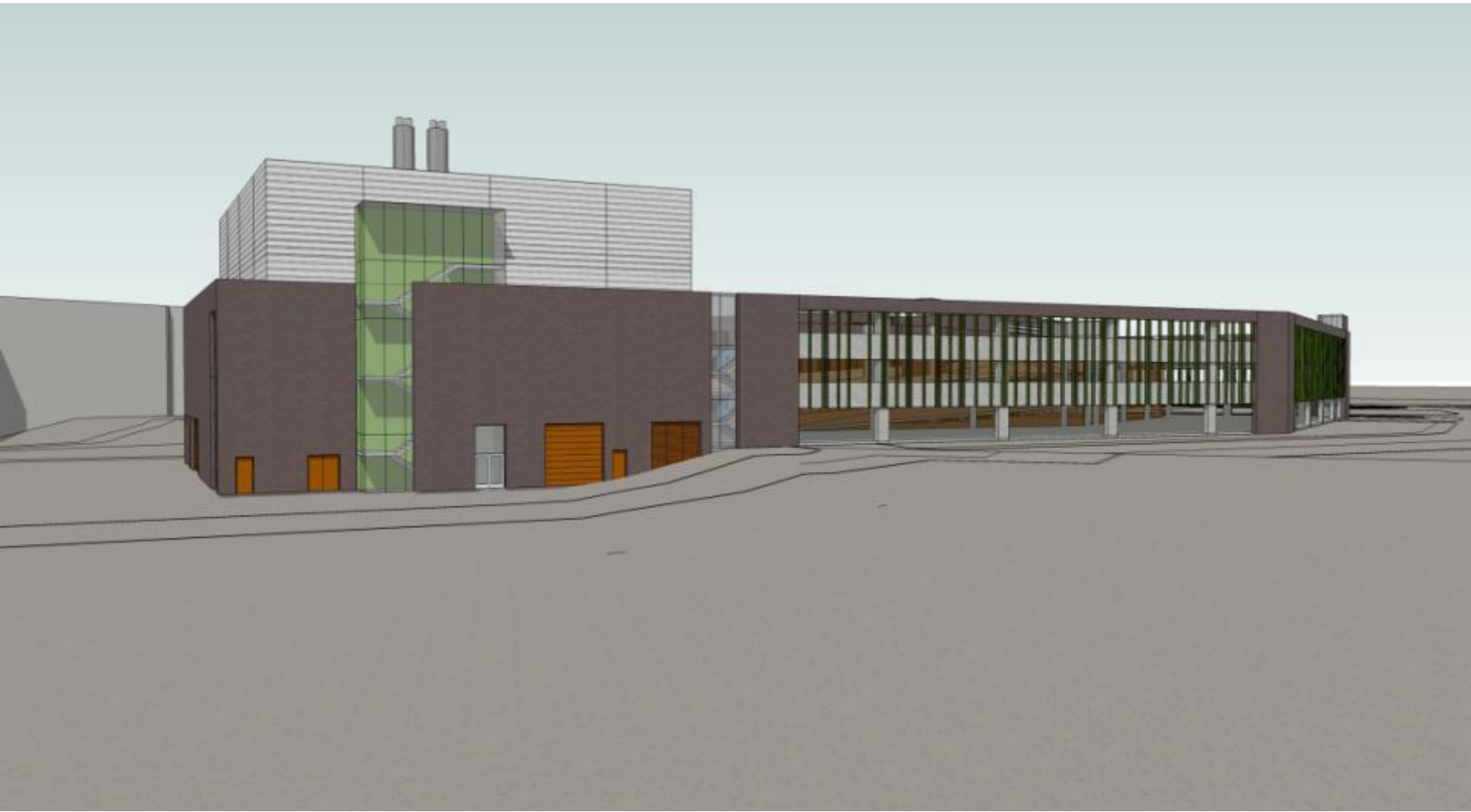
MDE Plant- view from south