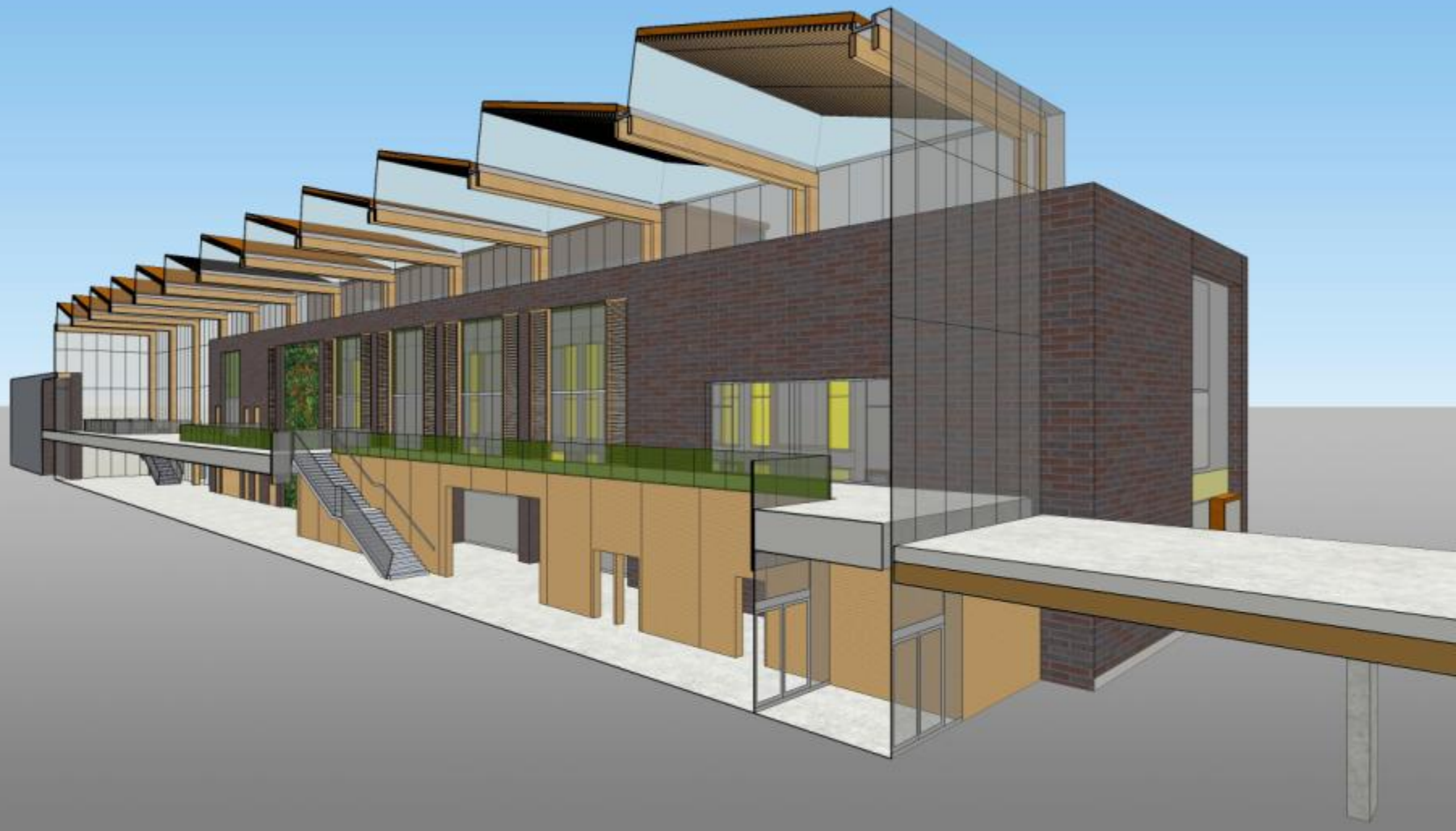
Common Space Skylight – proposed design