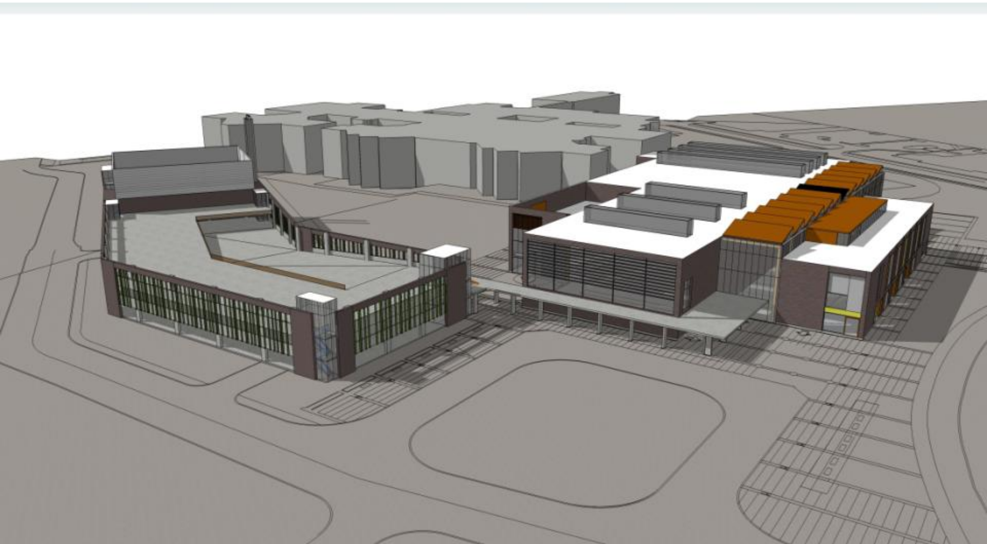
Parking Garage- aerial view from southeast