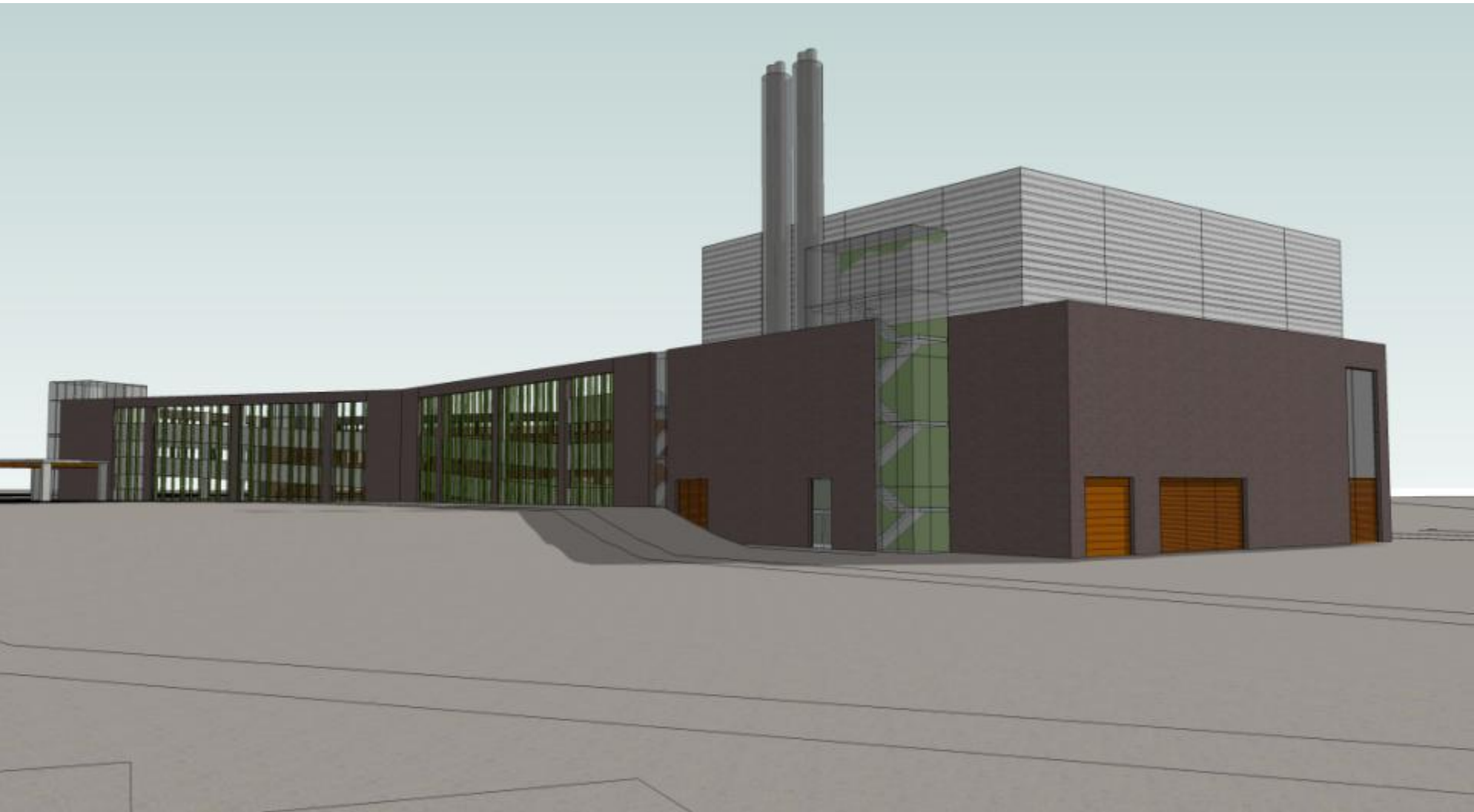
MDE Plant- northwest corner