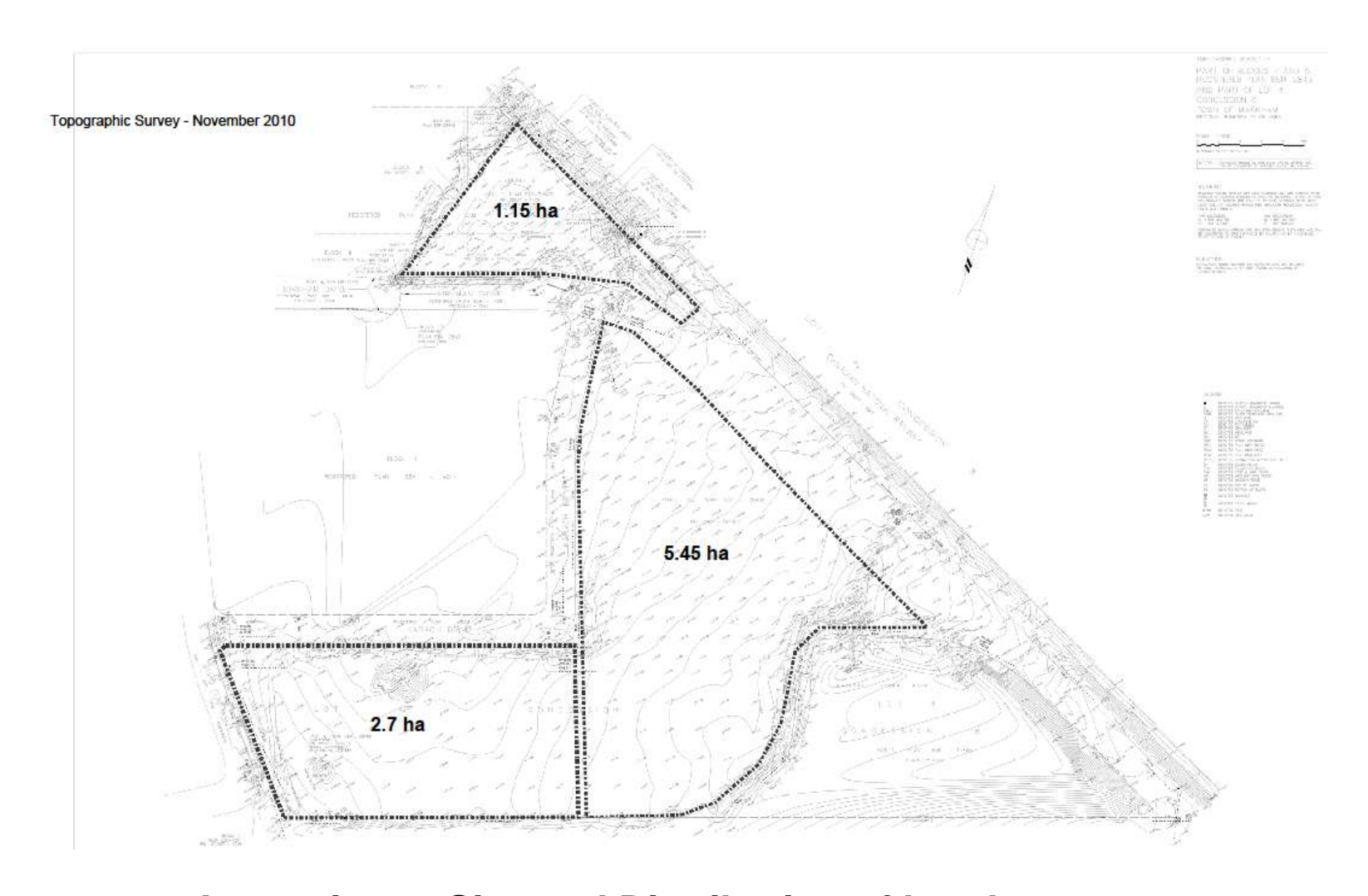
Approximate Size and Distribution of Land