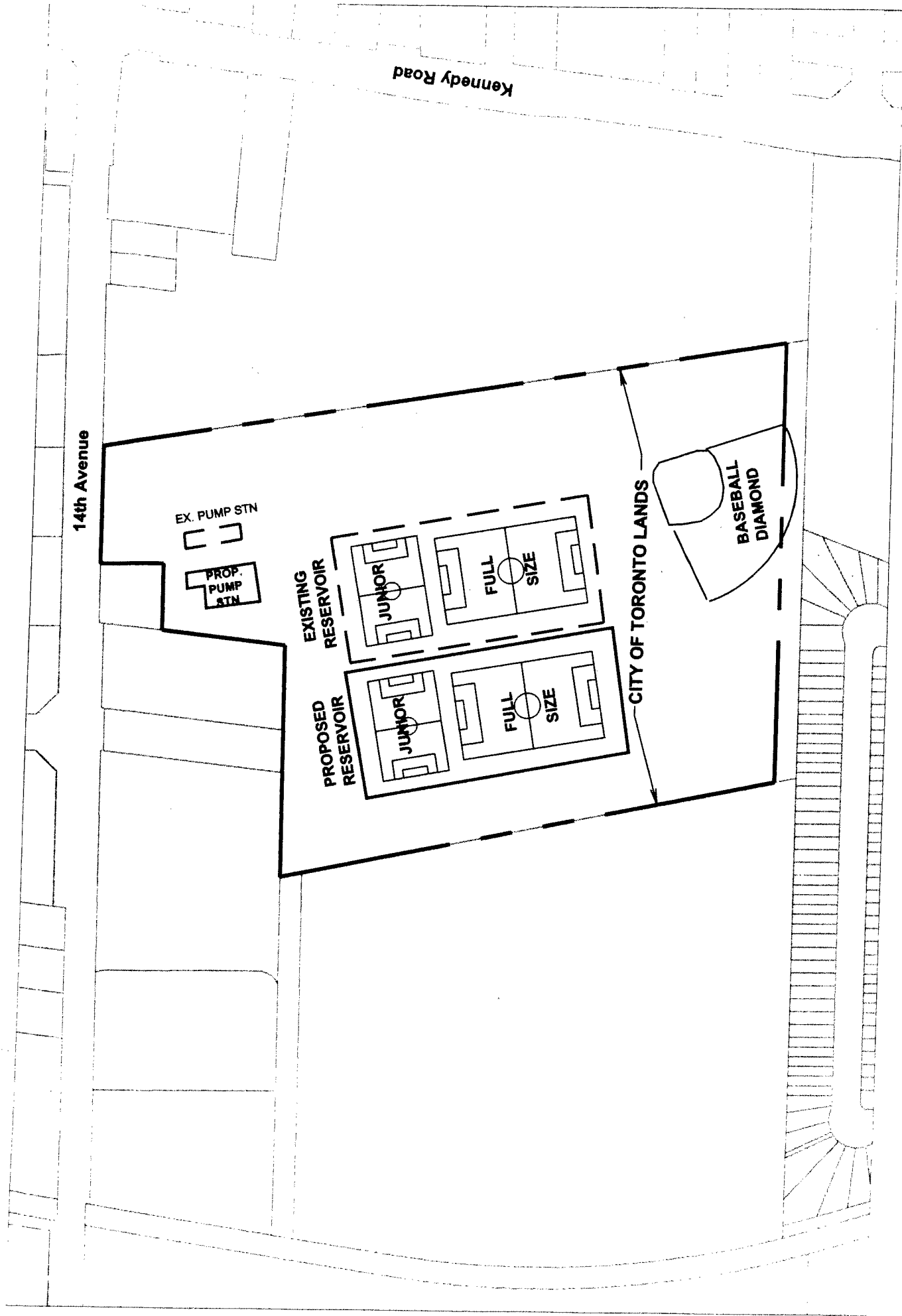
Attachment A: Layout of Fields