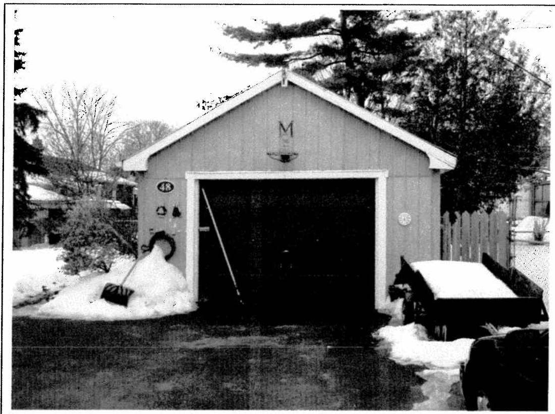
48 Albert Street. Above: Front of garage. Below: South elevation.