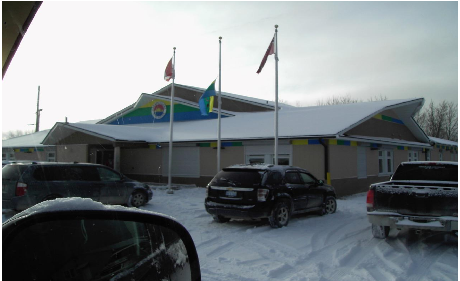
EFN Municipal Building