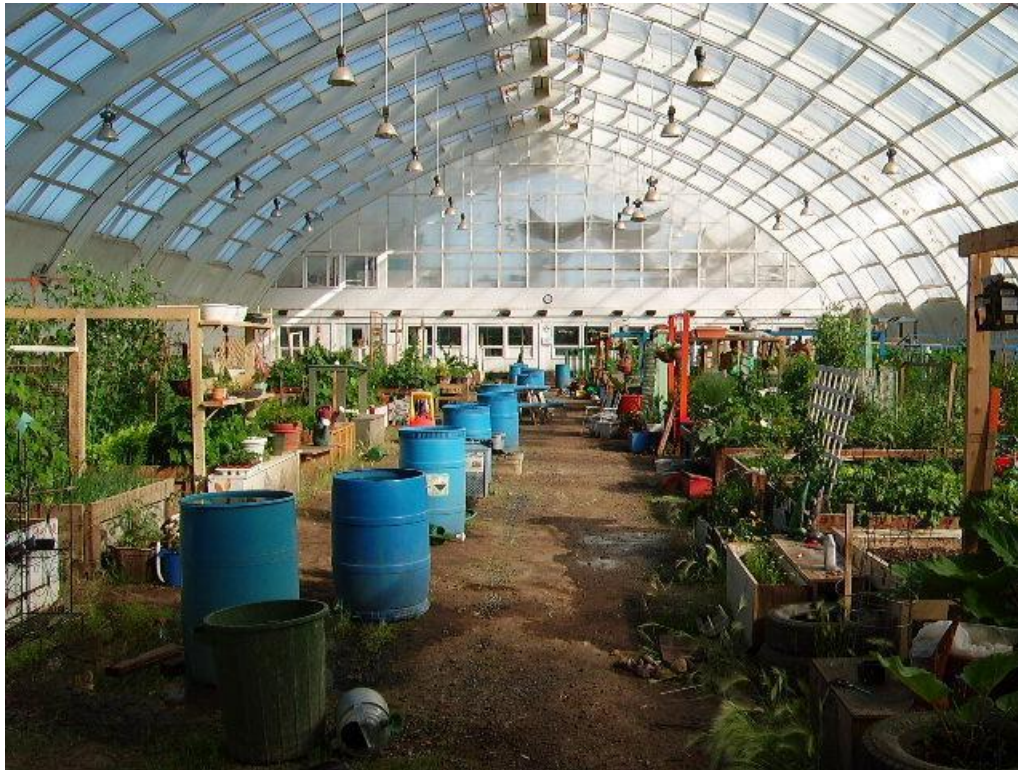
Inuvik Community Greenhouse, Northwest Territories