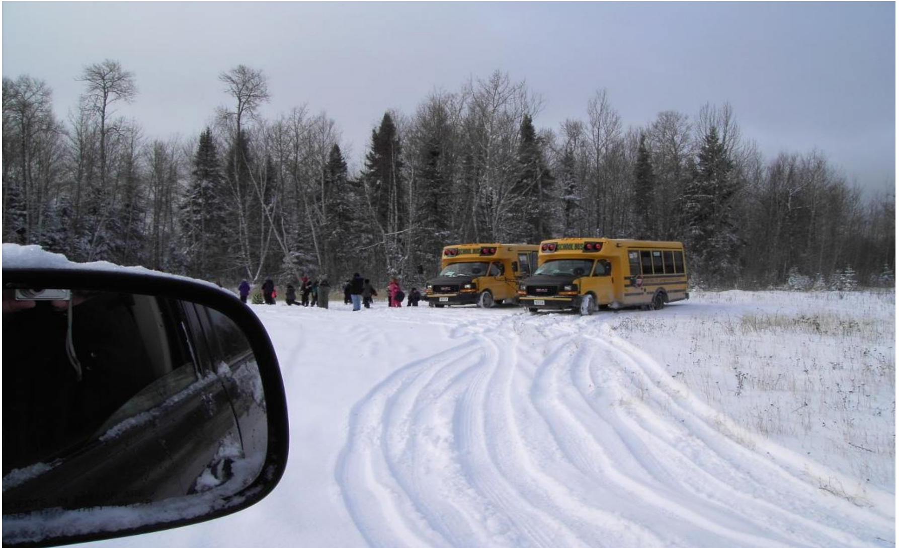
Children arriving at school