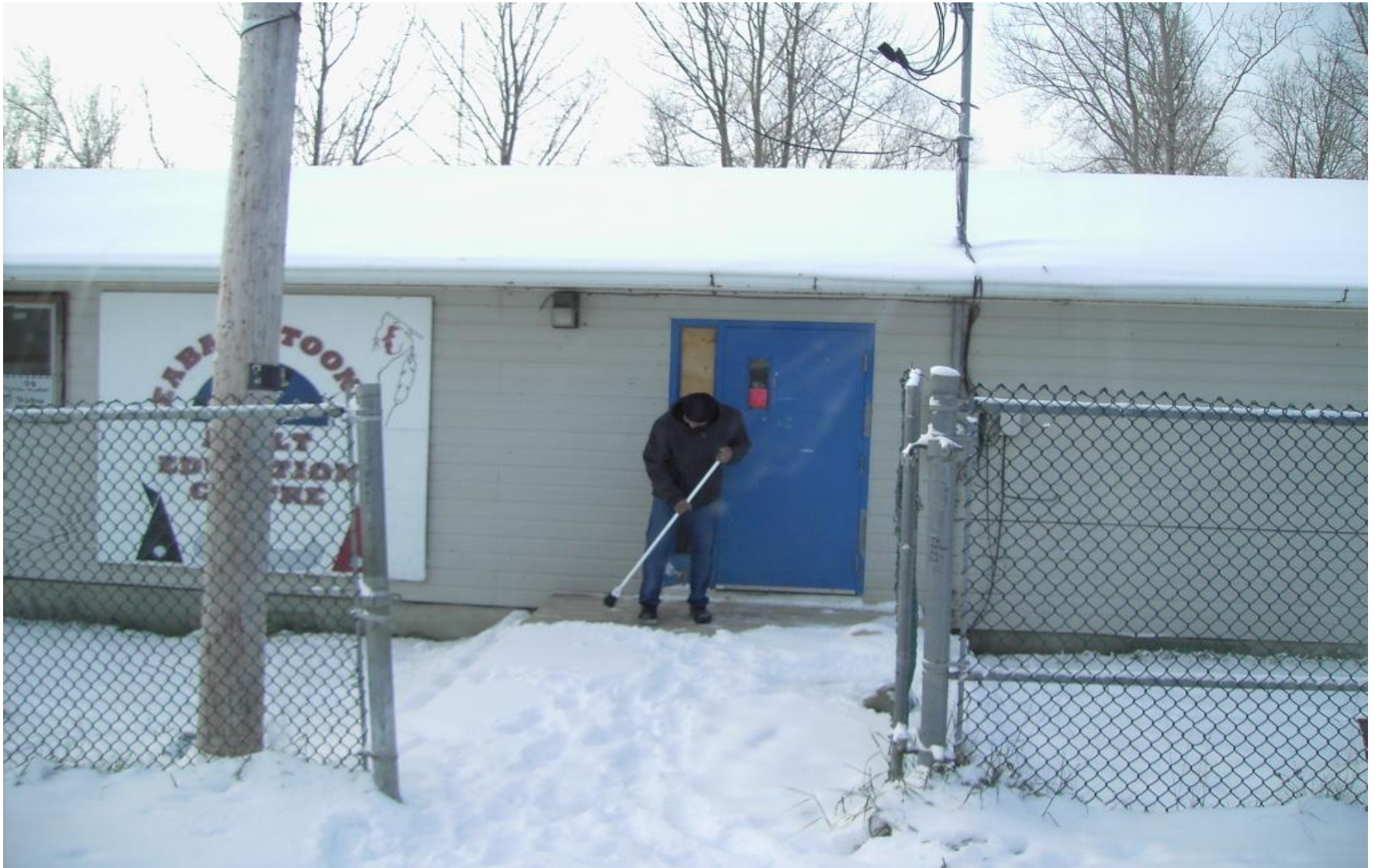
Eabametoong Adult Education Centre