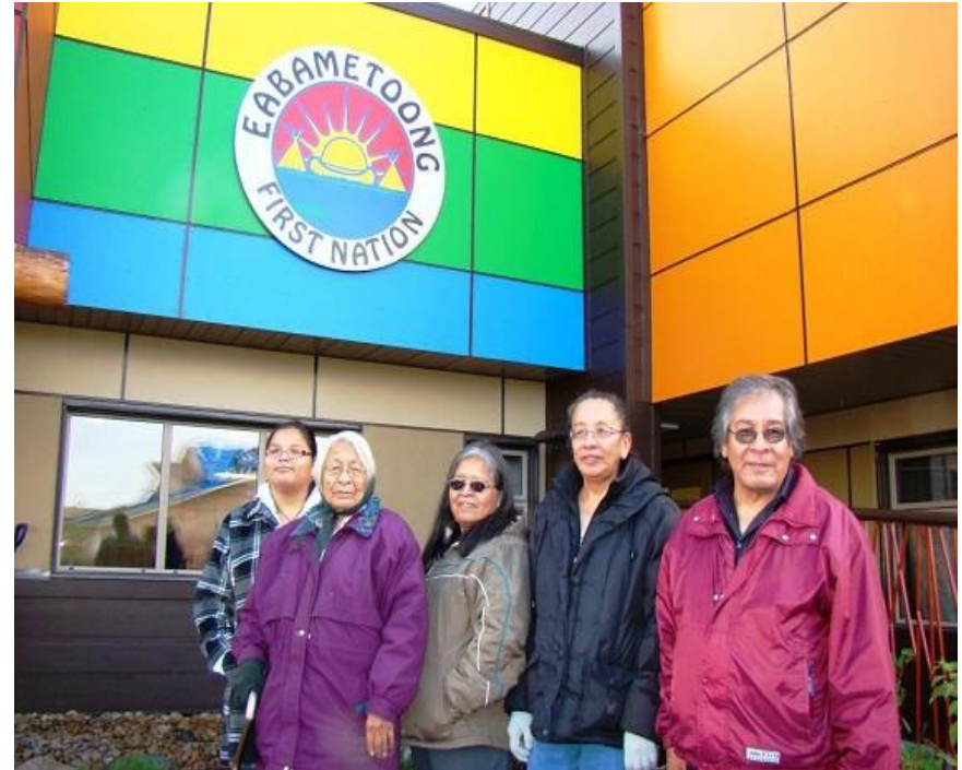
EFN Nursing Station