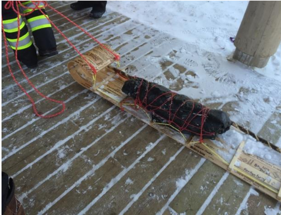
Norman Shewaybick's 1,000 km Oxygen Tank Walk