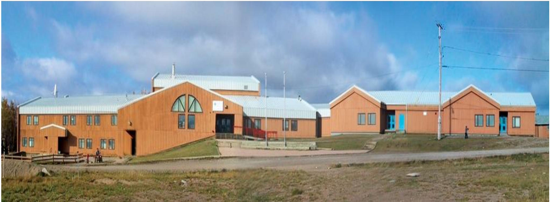
John C. Yesno Education Centre (JK-Grade 9)