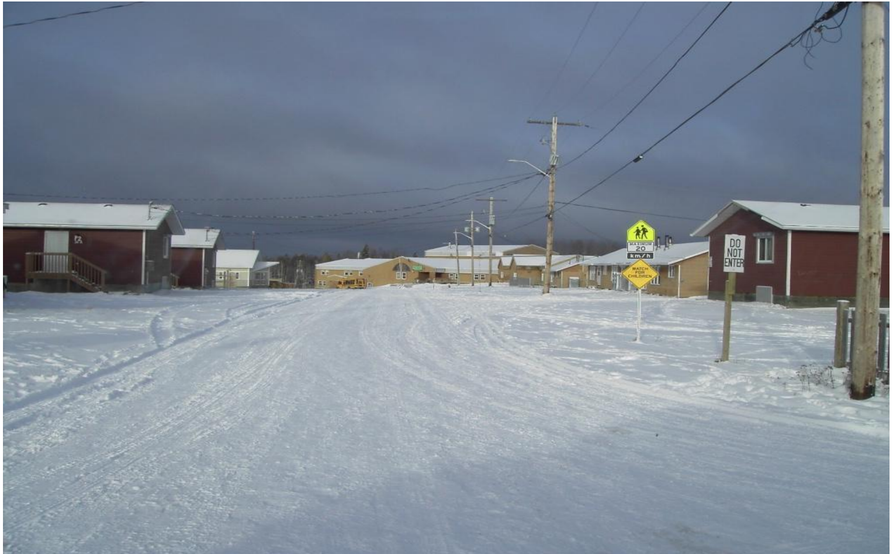
John C. Yesno Education Centre (JK-Grade 9)