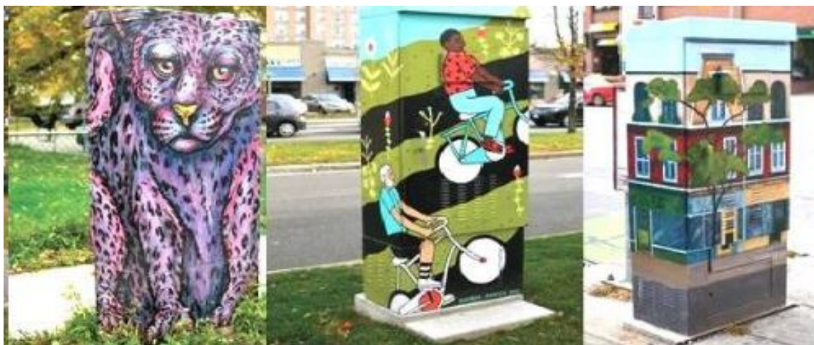
City of Toronto