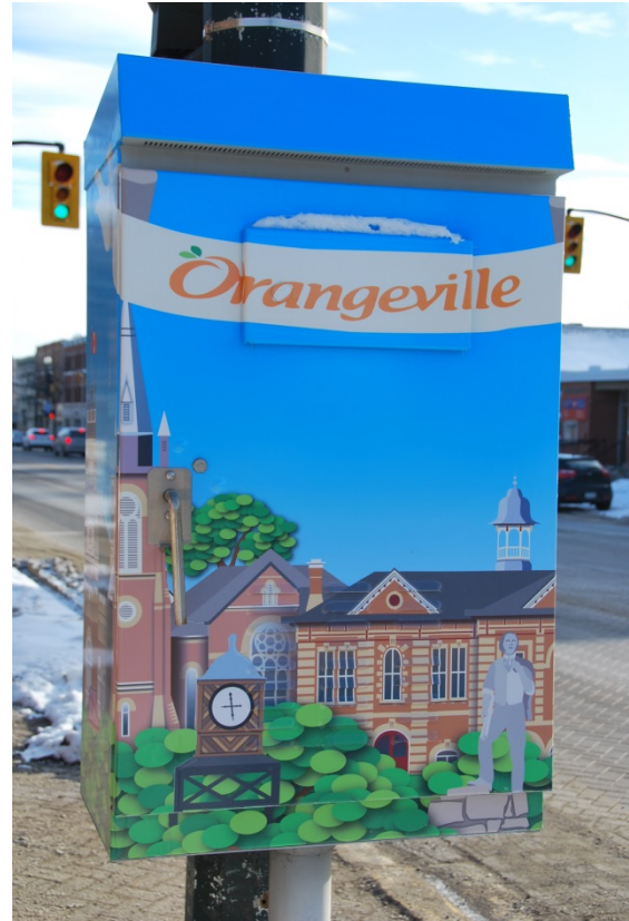
Town of Orangeville