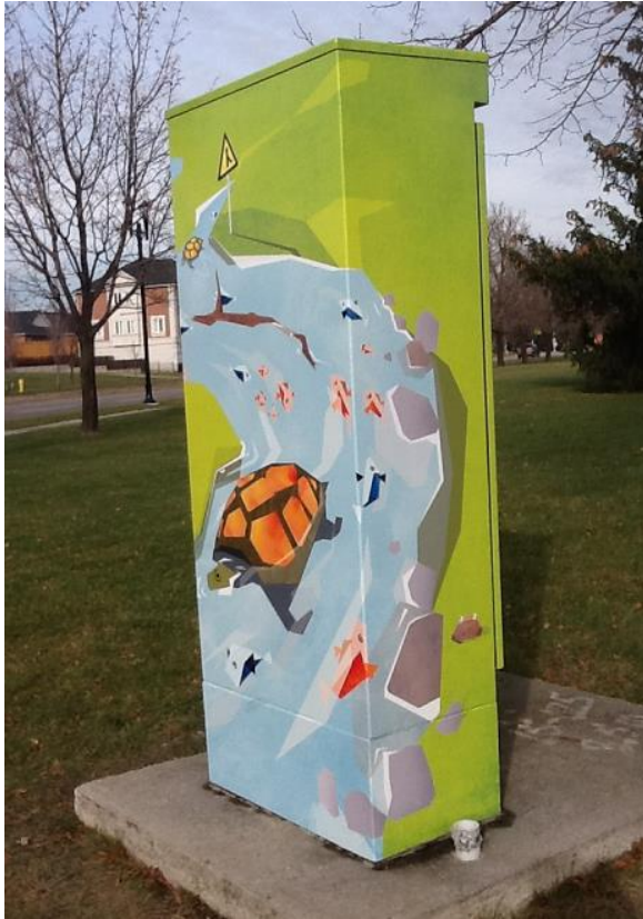
City of Markham