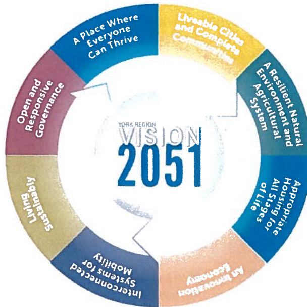
Figure 1 The Vision for 2051

The blueprint for Vision 2051 is about creating strong, caring and safe communities. It helps inform Council direction and the Region's Strategic Plan. The timing is right to undertake a review of Vision 2051 as the goal areas provide guidance on how the Region should grow and directly relate to the Regional Official Plan.