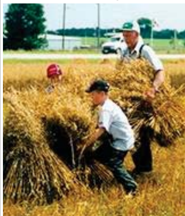
Geared for Growing Exhibition