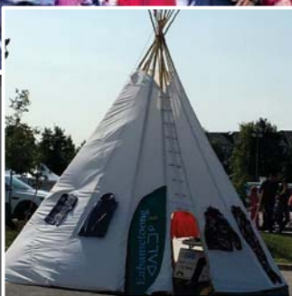
Eabametoong First Nation at Markham Expo 150