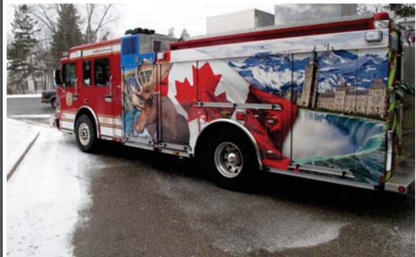
Canada 150-wrapped Apparatus, Engine 9-1-1