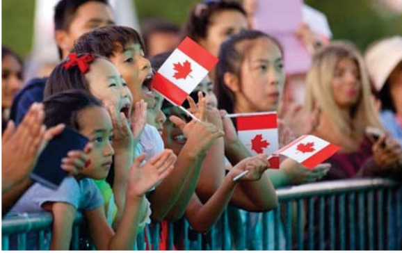
Canada Day Celebration