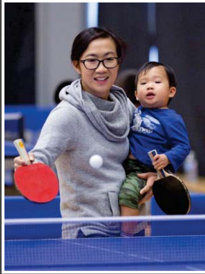
Markham Sports Day