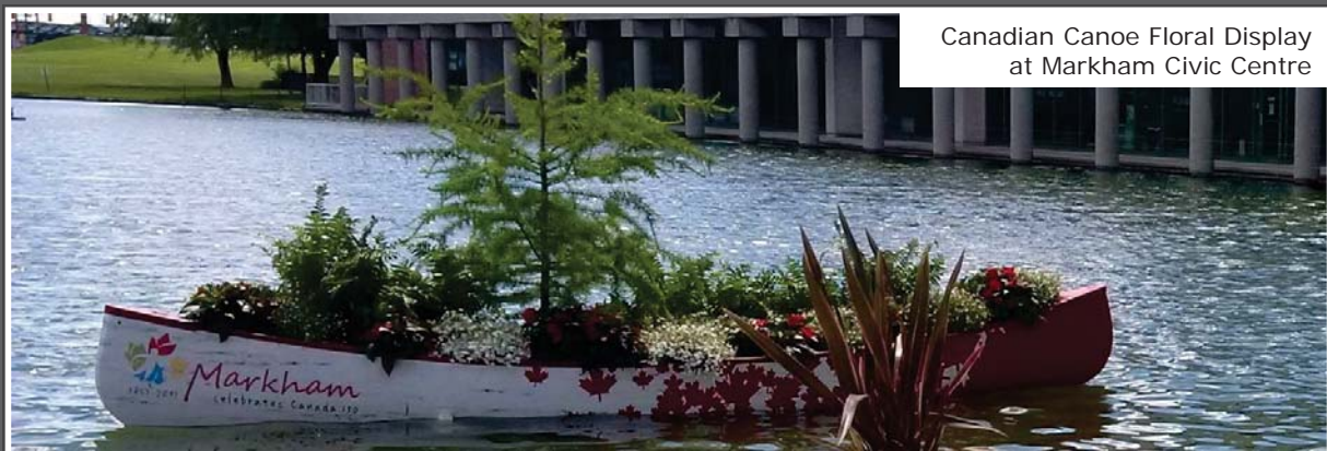
Canadian Canoe Floral Display at Markham Civic Centre