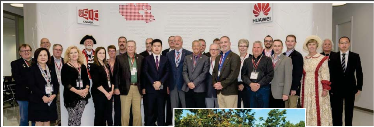
Visit from Cary and Nördlingen Delegations