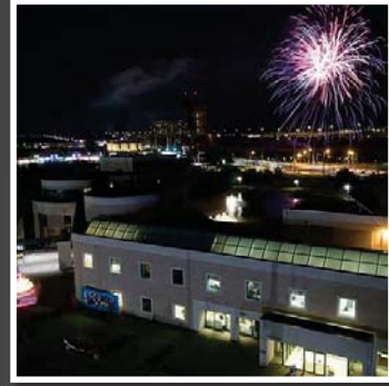
Markham Expo 150