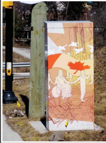
Public Realm Traffic Wrap Program