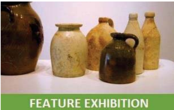
From the Ground Up Exhibition