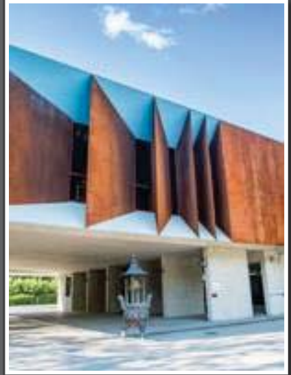
Doors Open Markham