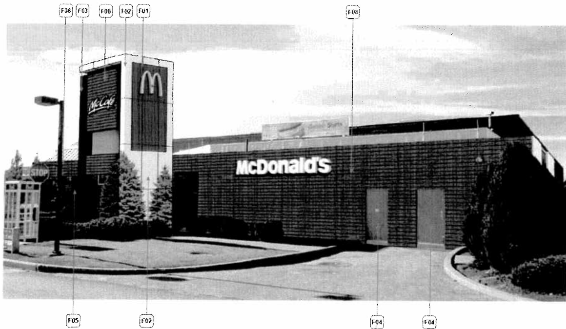
Figure 4b – Proposed east elevation and façade material