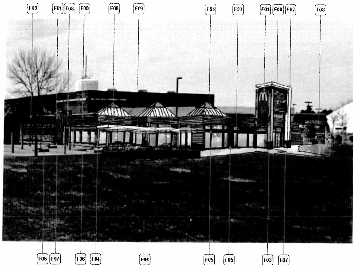
Figure 4a – Proposed south and east elevations and façade materials