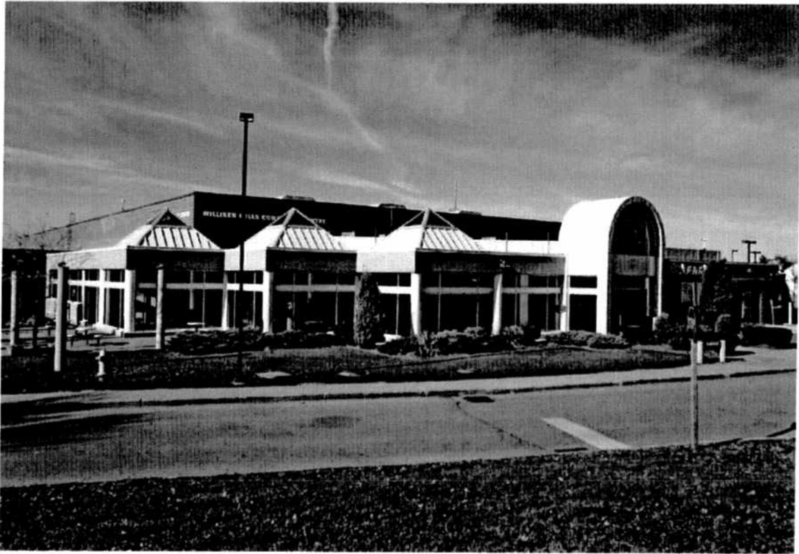
View from Kennedy Road looking northwest