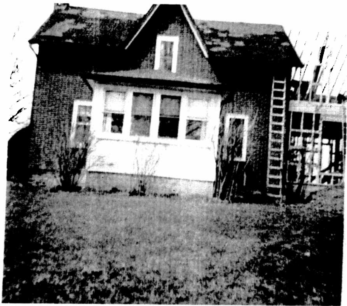
Jarvis-Fairty House, renovations underway in 1961.