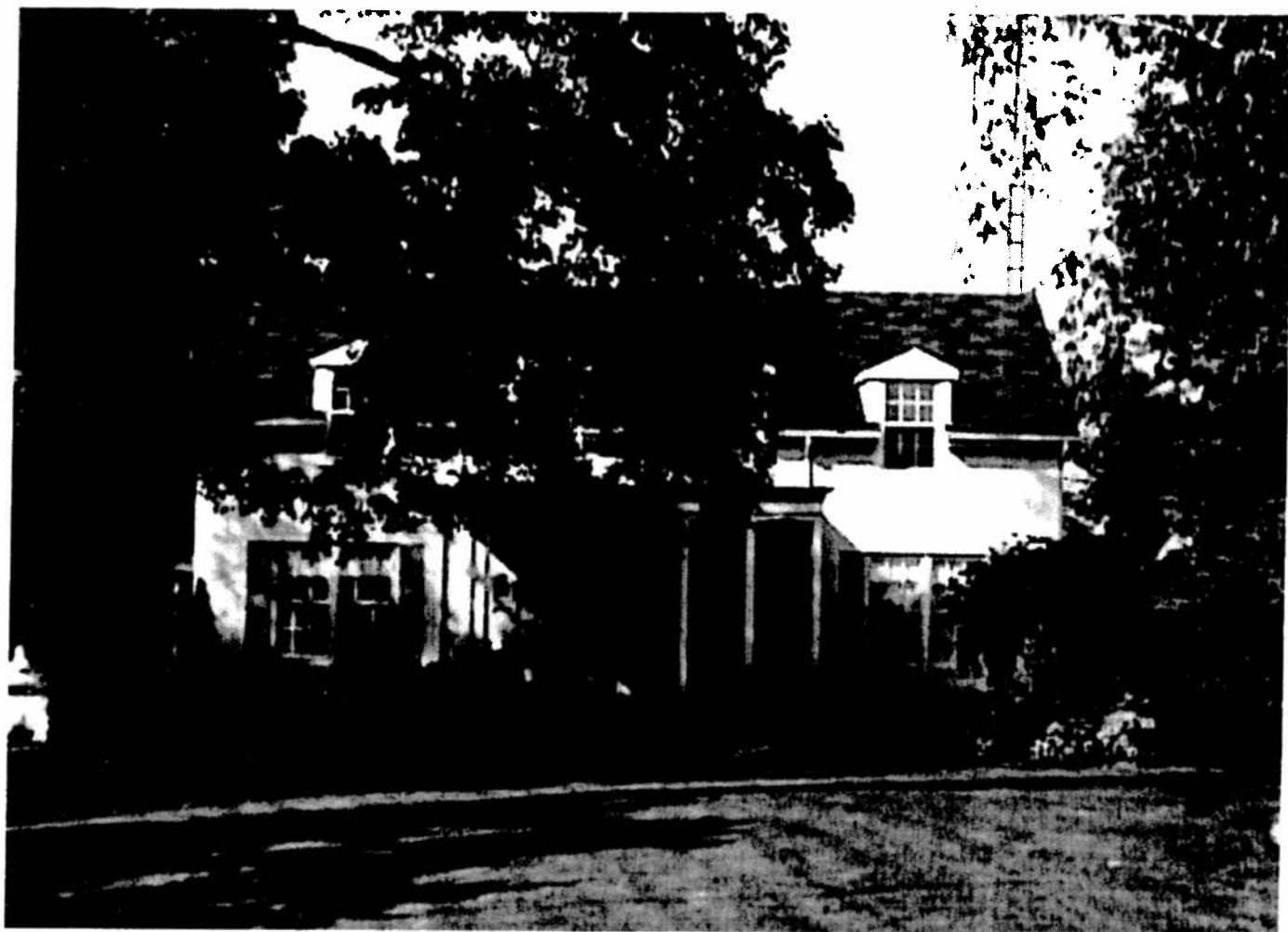
Jarvis-Fairty House, current photo.