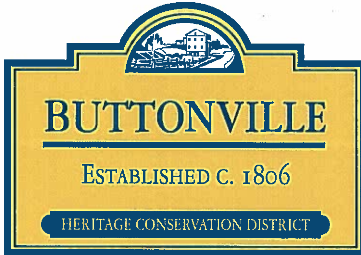
Proposed Entry Signage