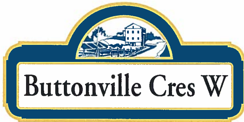
Proposed Street Signage