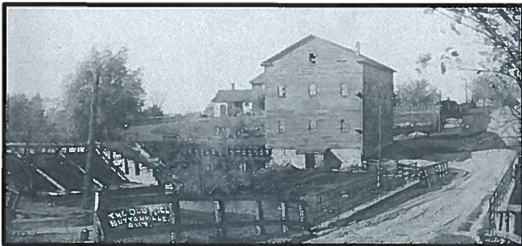
Archival Photograph of the Venice Grist Mill Buttonville