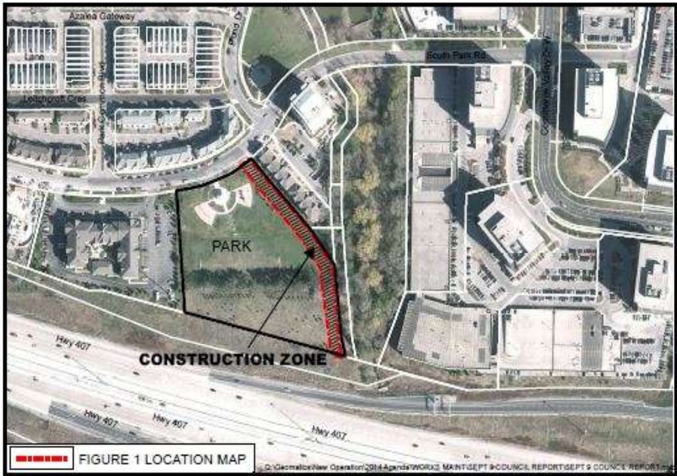
Figure 1 – Location Map