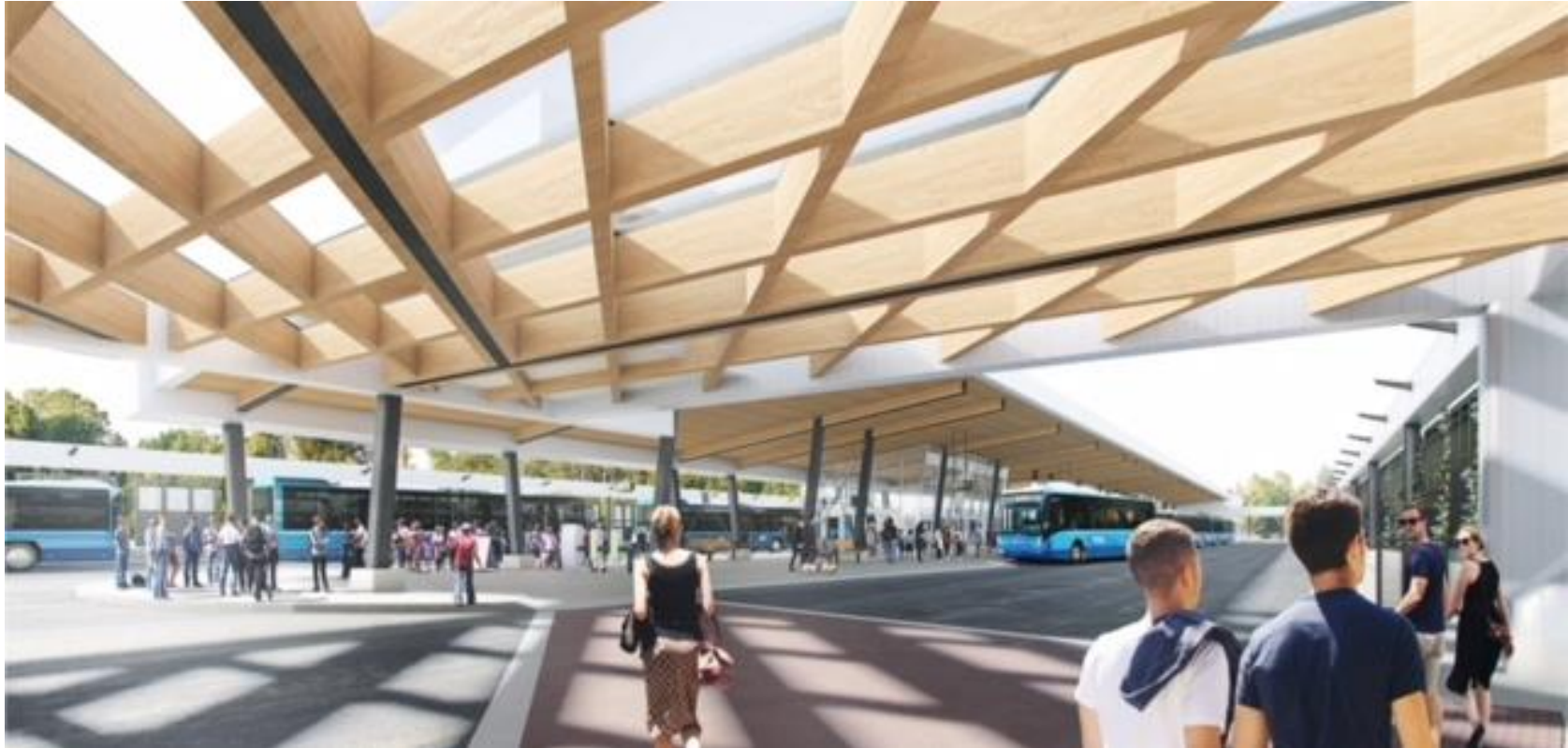
Covered pedestrian access to bus platforms (wood trellis with glazed roof)