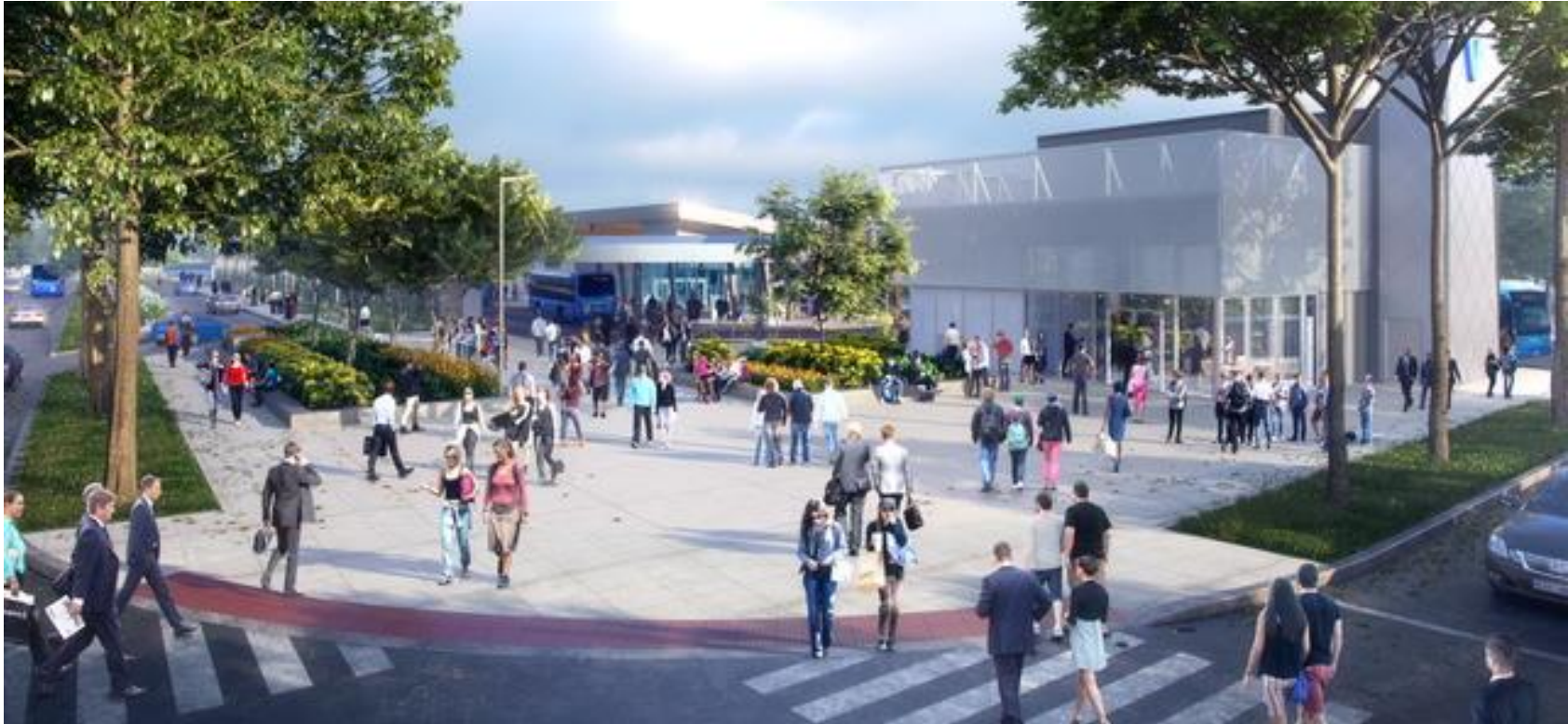
Northeast pedestrian plaza

(looking southwest from corner of Rustle Woods and Diamondwood)