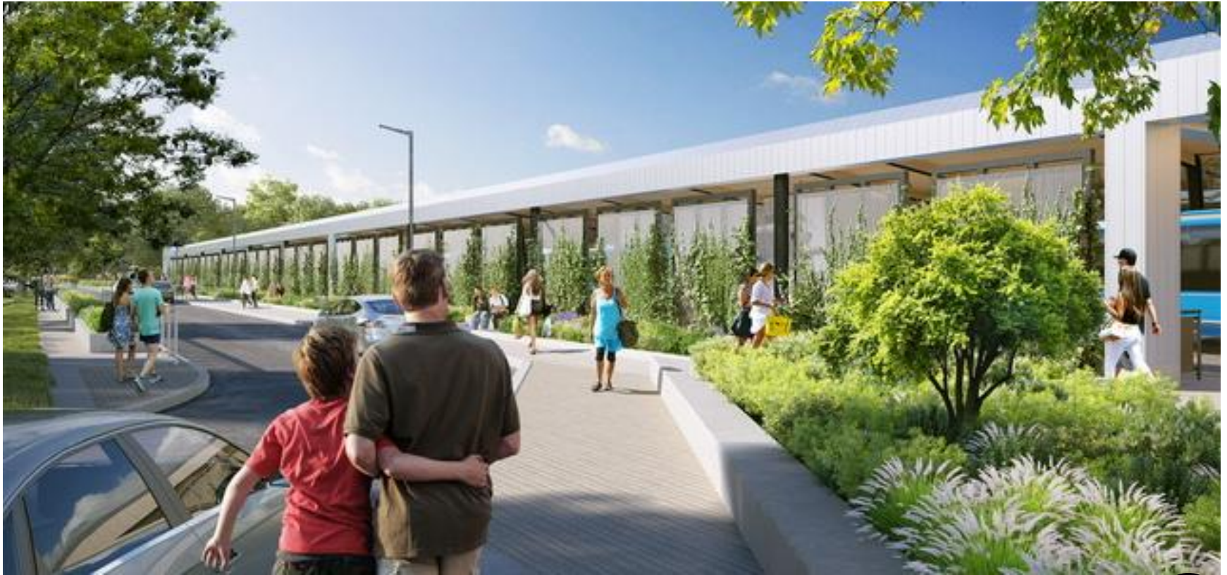
Landscaped East Façade and Passenger Pick-Up and Drop-Off (looking southwest)