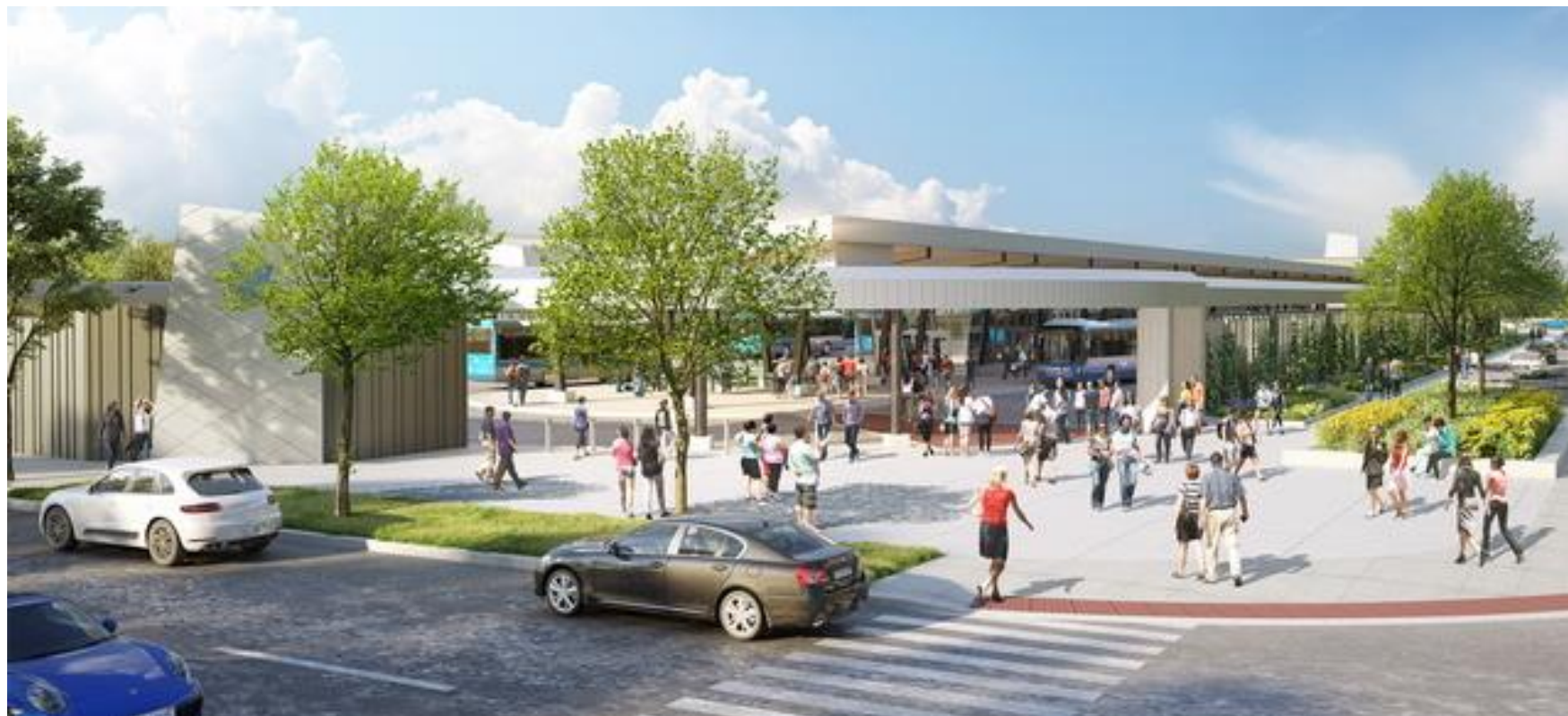
Southeast pedestrian plaza

(looking northwest from corner of Arthur Bonner and Diamondwood)