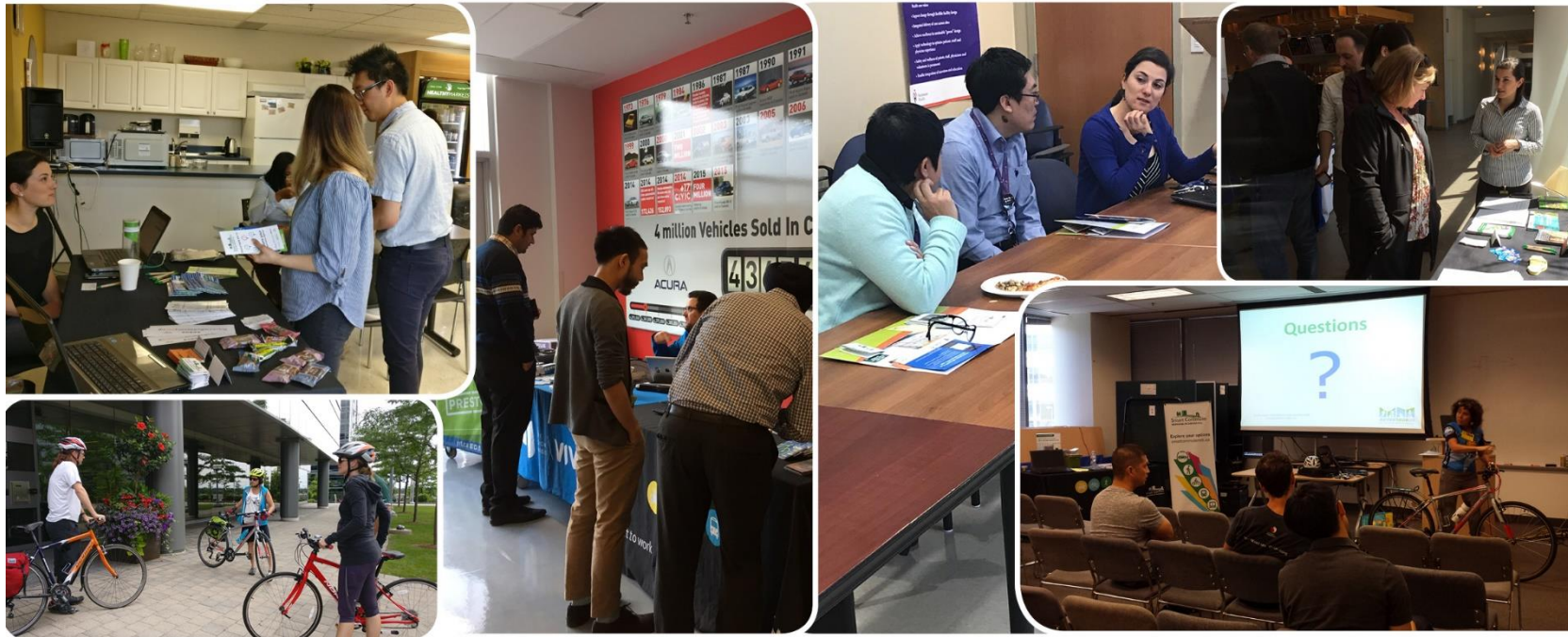
Top Left: Commuter Café at COLE