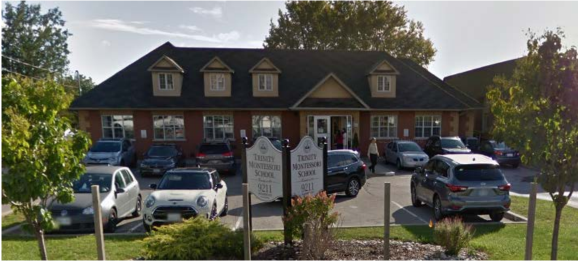
8 Chapel Place (2009 photo)