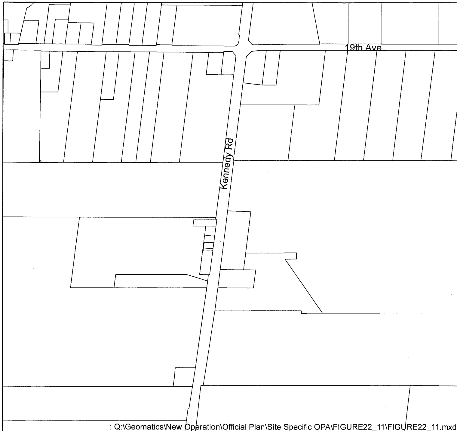
FIGURE No. 22.11