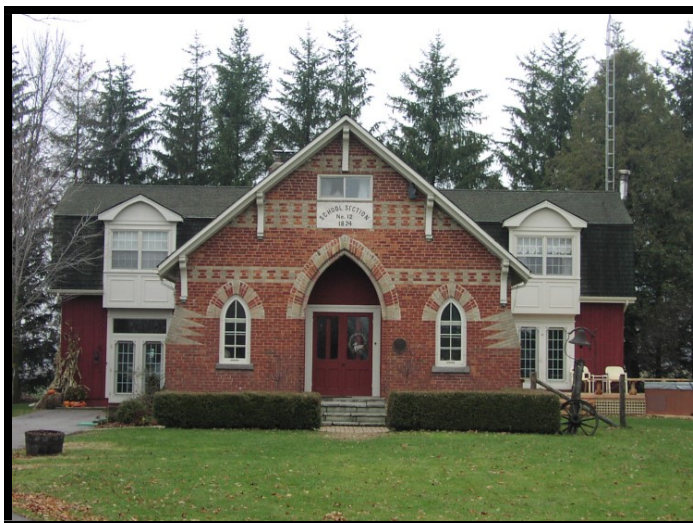
Before the Fire