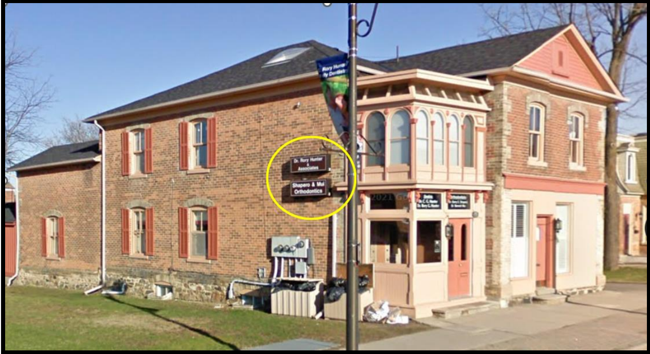
Google Street View image from 2009