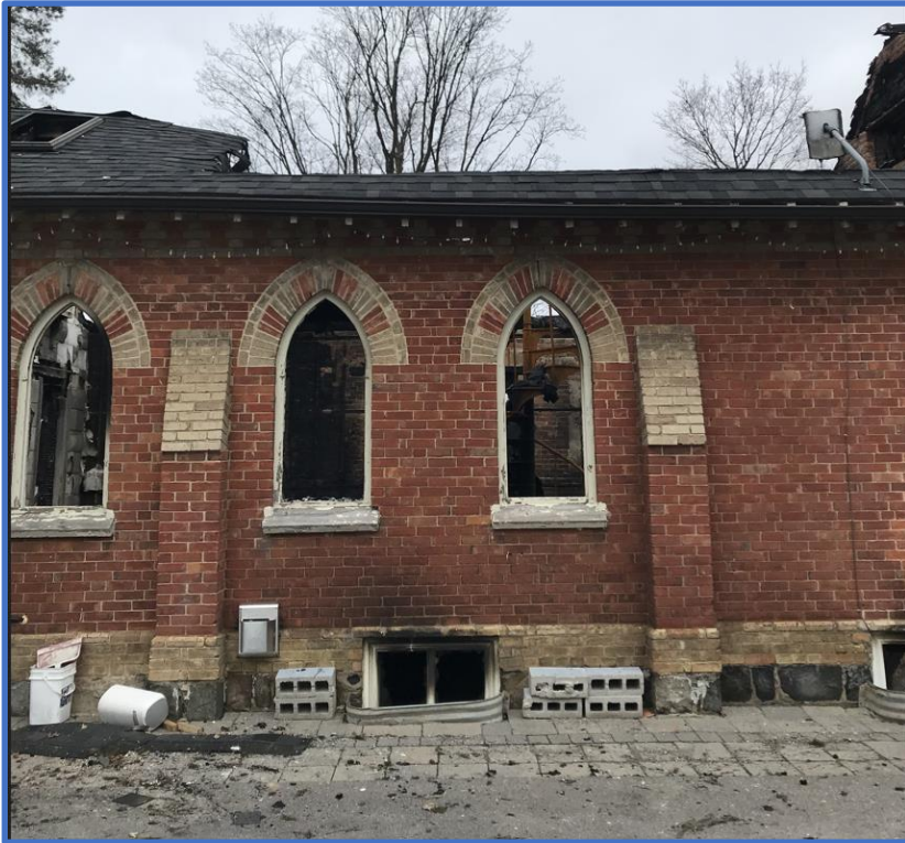
Appendix C Recent photograph of the Clayton Schoolhouse submitted with Demolition Permit application