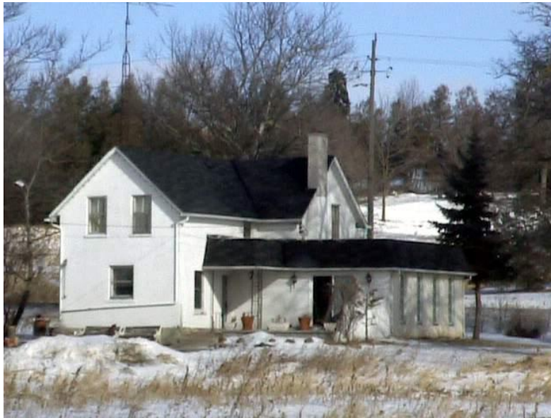
Peter Milne Jr. House East Half Lot 26, Concession 7 5970 Elgin Mills Road East, Milnesville c.1870

Heritage Section City of Markham Planning & Urban Design 2024