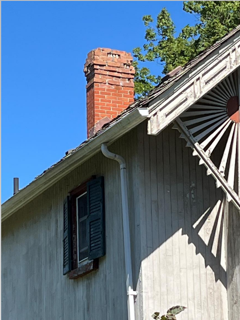
#1 Heritage Corners Lane