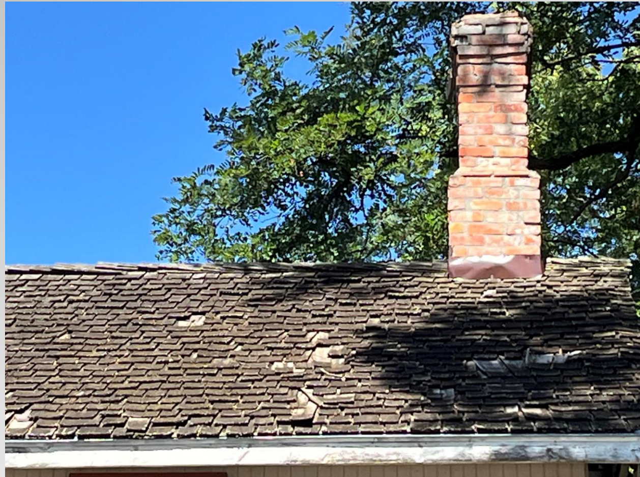
MHE Gateway house ... Declare a structural danger zone (missing shingles & falling bricks)