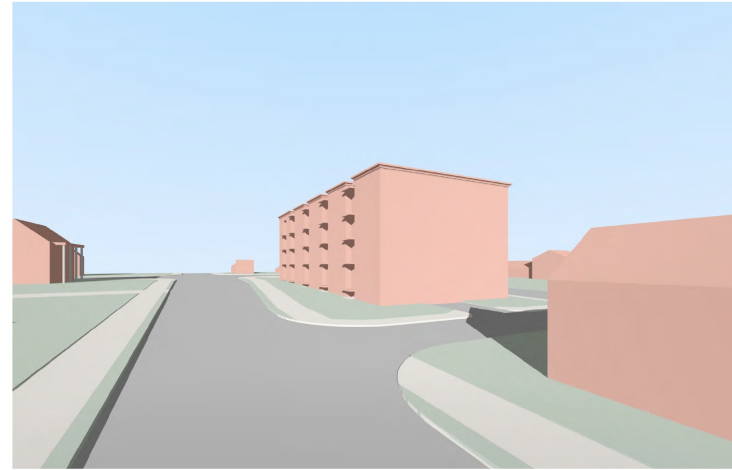
VIEW FROM SOUTH-WEST