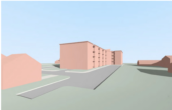
VIEW FROM SOUTH-EAST