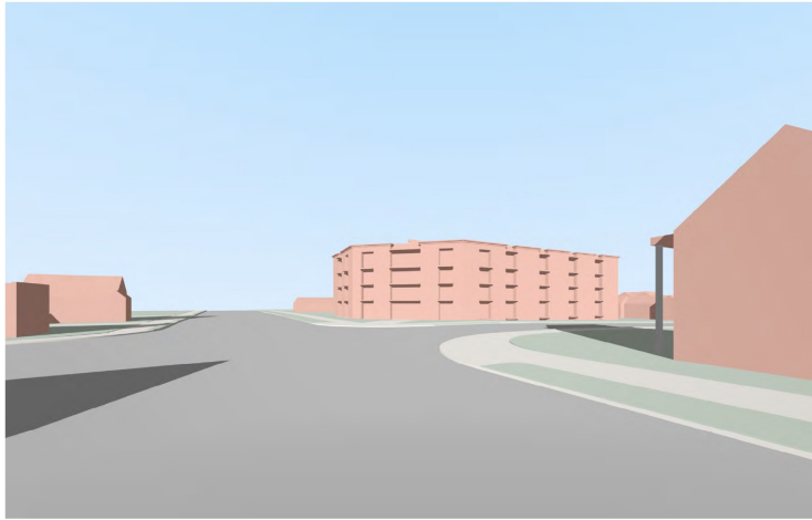
VIEW FROM NORTH-WEST