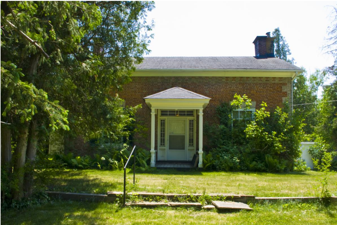
The north (primary) elevation of the heritage resource