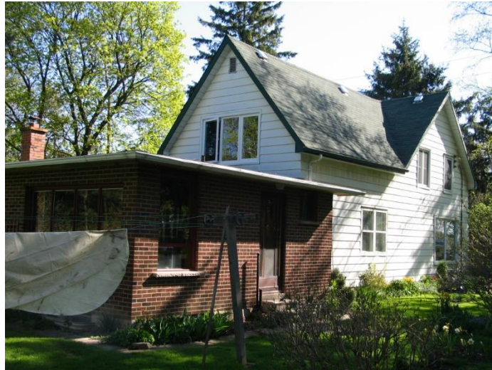
7696 Ninth Line. West and south side view showing rear wing and 1960s addition.

The side porch has a simple shed roof supported on slender square wooden posts. It does not appear to be very old, but it could occupy the same space as an earlier porch that may have existed in this location. There is a single-leaf door within the side porch, at the east end of the north wall of the rear wing.