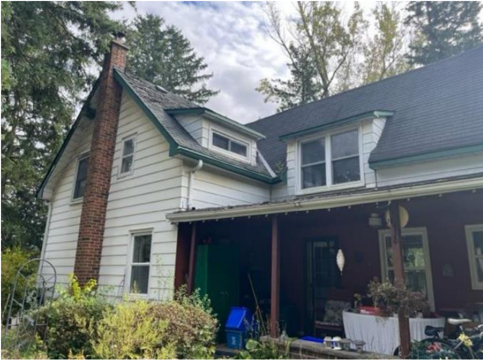
The north elevation of the on-site dwelling as seen in October 2023