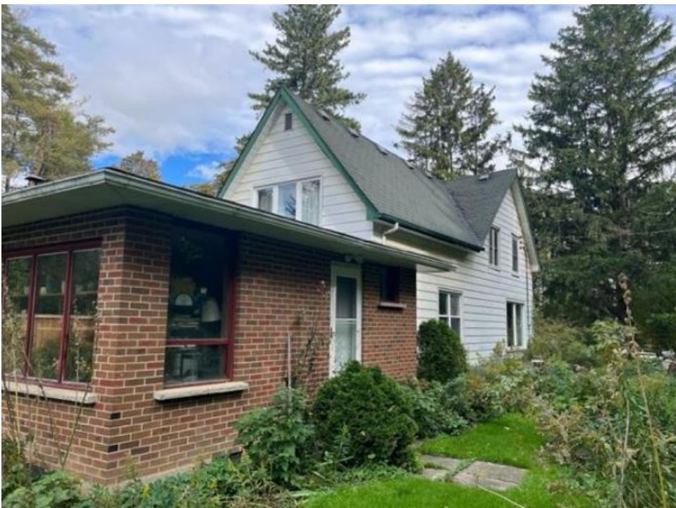
The east (primary) elevation [above] and the west/south elevations of the on-site dwelling [below] as seen in October 2023