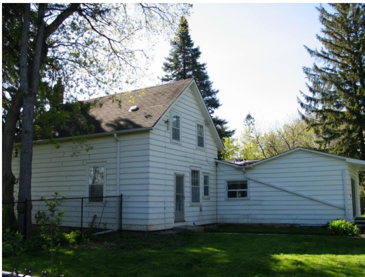
Rear and north side of 7560 Ninth Line showing volume of the oldest portion of the house and a later one-storey addition.

A side wing extends from the south side of the dwelling's northern section. Its roofline is set slightly lower than that of the north wing. The pitch of its gable roof changes to a lower slope on its east or front side, suggesting that this area of the house could be an infilled ell. There is a small, gable-roofed dormer near the intersection of the sidewing's roof with the roof of dwelling's north section. On the front wall is an exterior red brick fireplace chimney. To the right of that there is a single six-over six-window, set lower in the wall compared with the ground floor windows on the north section. On the south wall there is a single-leaf side door with a bracketed gable-roofed canopy positioned near the front corner, and a box bay window containing a three-part picture window. The door on this wall functions as the main entrance. It may be that before the ell was infilled the main door was on the east wall of the side wing.