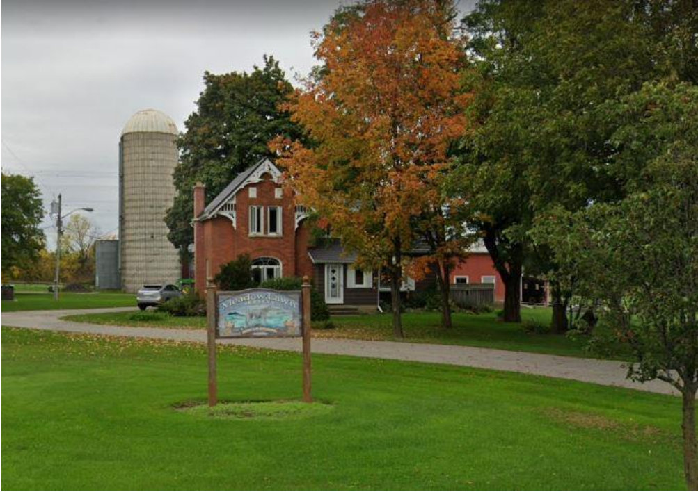
Image of the Property and Property Map