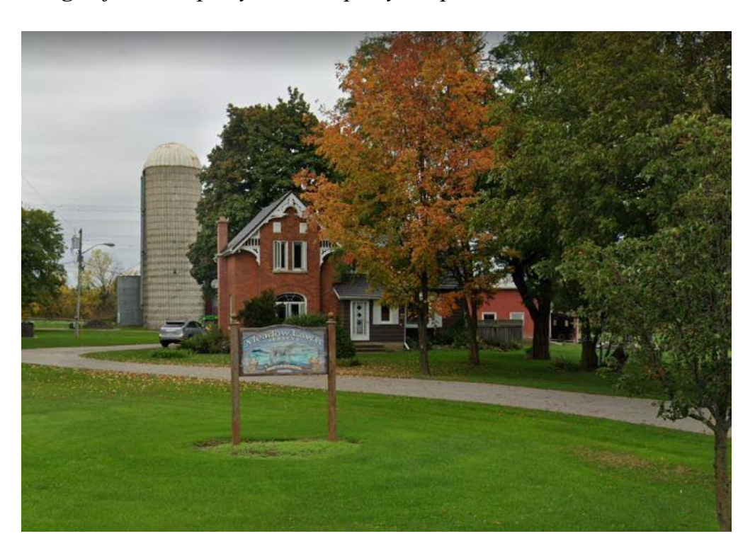
Appendix 'A' Image of the Property and Property Map