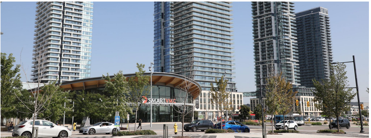
Vaughan Metropolitan Centre with bus terminal, office and residential buildings at Jane Street and Highway 7 in the City of Vaughan.

Region-wide, development interest for purpose-built rental housing continued to climb in 2023, reaching almost 8,200 proposed units across 34 developments. Rental housing proposals in Regional Centres and Corridor accounted for about 70% (5,700 units). These projects are primarily concentrated along the Yonge Street and Highway 7 East corridors. In 2023, two purpose-built rental housing developments were completed in the Vaughan Metropolitan Centre and Davis Drive, adding 580 units of rental housing supply.