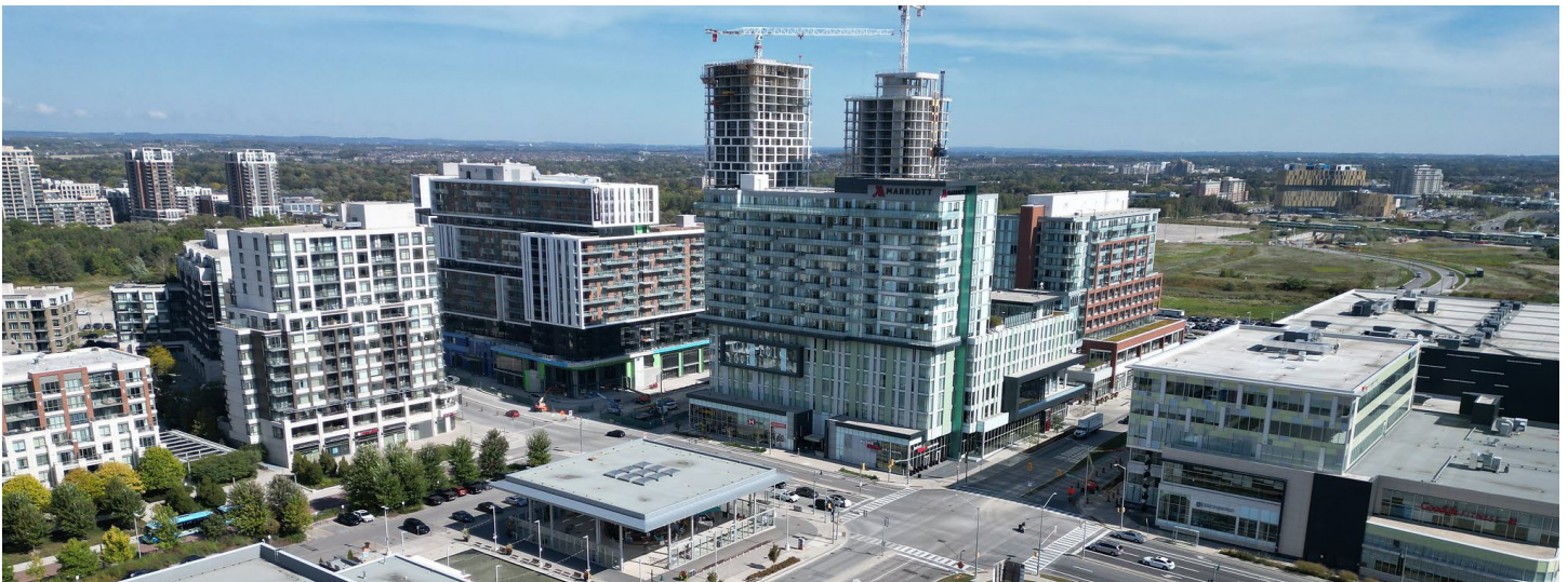
Markham Centre with office, commercial, and residential buildings near Warden Avenue and Highway 7 in the City of Markham.

Jobs generated from new developments are falling short of Regional Official Plan residents to job target of 2:1. The Region continues to leverage implementation tools such as incentive programs and strengthen partnerships across disciplines and sectors to bring investments, create jobs and build destinations attracting employment, retail, recreational and other lifestyle amenities to Regional Centres and Corridors.