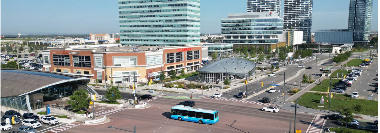
Vaughan Metropolitan Centre with subway and bus stations, office and residential buildings at Jane Street and Highway 7 in the City of Vaughan.

Approximately 17,700 square meters of commercial space was added to Regional Corridors in 2023, along Highway 7 and Yonge Street corridors. Development proposals currently in the planning approval process are estimated to bring an additional 580,000 square meters of office spaces to Regional Centres and Corridors.