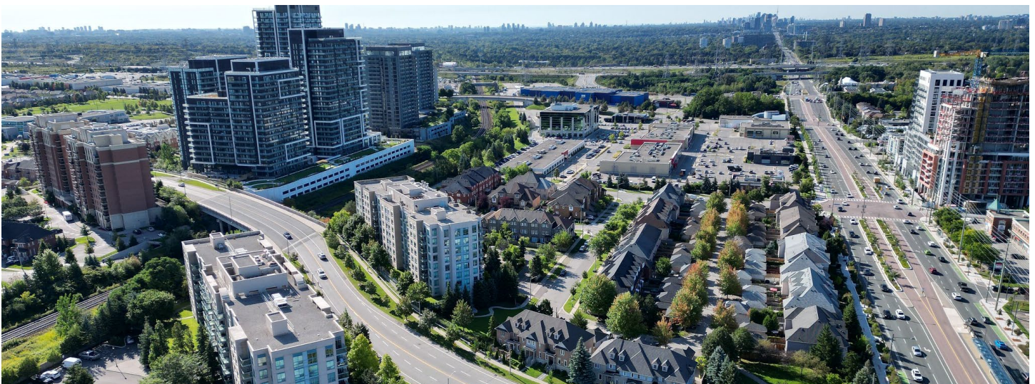
Richmond Hill Centre with office, commercial and residential buildings at Yonge Street and Highway 7 in the City of Richmond Hill.