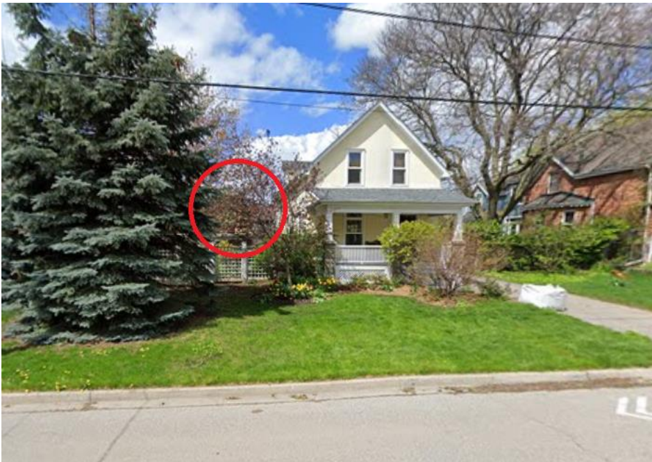
The Subject Property as seen from Peter Street. The eastern slope of the barn roof is circled in red. This is the only location where the proposed solar panels will be visible from the street