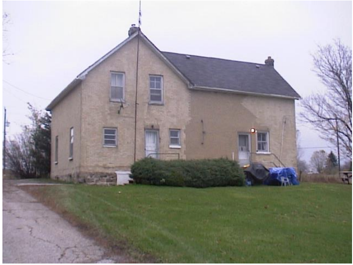
Rear or west view of 10982 Highway 48 showing patch in the brickwork, a possible indication that a rear wing has been removed.

The recessed front wall at the south end of the dwelling has a three-bay arrangement of openings, with a central door that has been bricked in. Flanking the former door are two-over-two paned windows. In the steep centre gable, there is a flat-headed window with a two-over-two pane division. An additional exterior door is tucked into the angle formed by the intersection of the two wings of the L-plan on the south wall of the front projecting bay. On the second floor of that same wall is a small square-shaped window which may be a later addition.