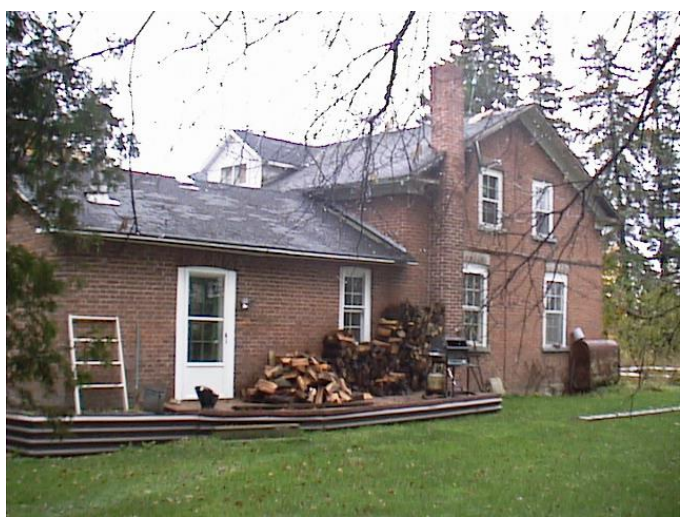
West view of 11287 McCowan Road showing gable-end and one-storey rear wing.

The south-facing primary elevation is composed of three-bays with a pronounced asymmetrical placement of openings. The single-leaf door, no longer in use, is significantly offset to the east, with a single-hung window with six-over-six panes located to its right, and another six-over-six paned window more widely separated from the door to the left. A wooden nailing strip on the front wall above the arches over the windows, wrapping around to the west gable end wall, is evidence of a former veranda.