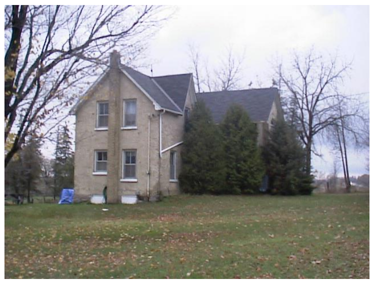
10982 Highway 48 showing south wing. Much of the primary elevation is obscured by mature vegetation.

There is no veranda in the street-facing ell. In a house of this style, a veranda was a typical feature. In Markham Township there are a few examples of dwellings, in both rural and village settings, where a veranda or covered porch were intended but never built. In other examples, verandas were removed over time, but in most cases, marks on the wall remain to indicate the roofline and possibly the shape of the posts. Here, no markings can readily be seen to indicate the former existence of a veranda.