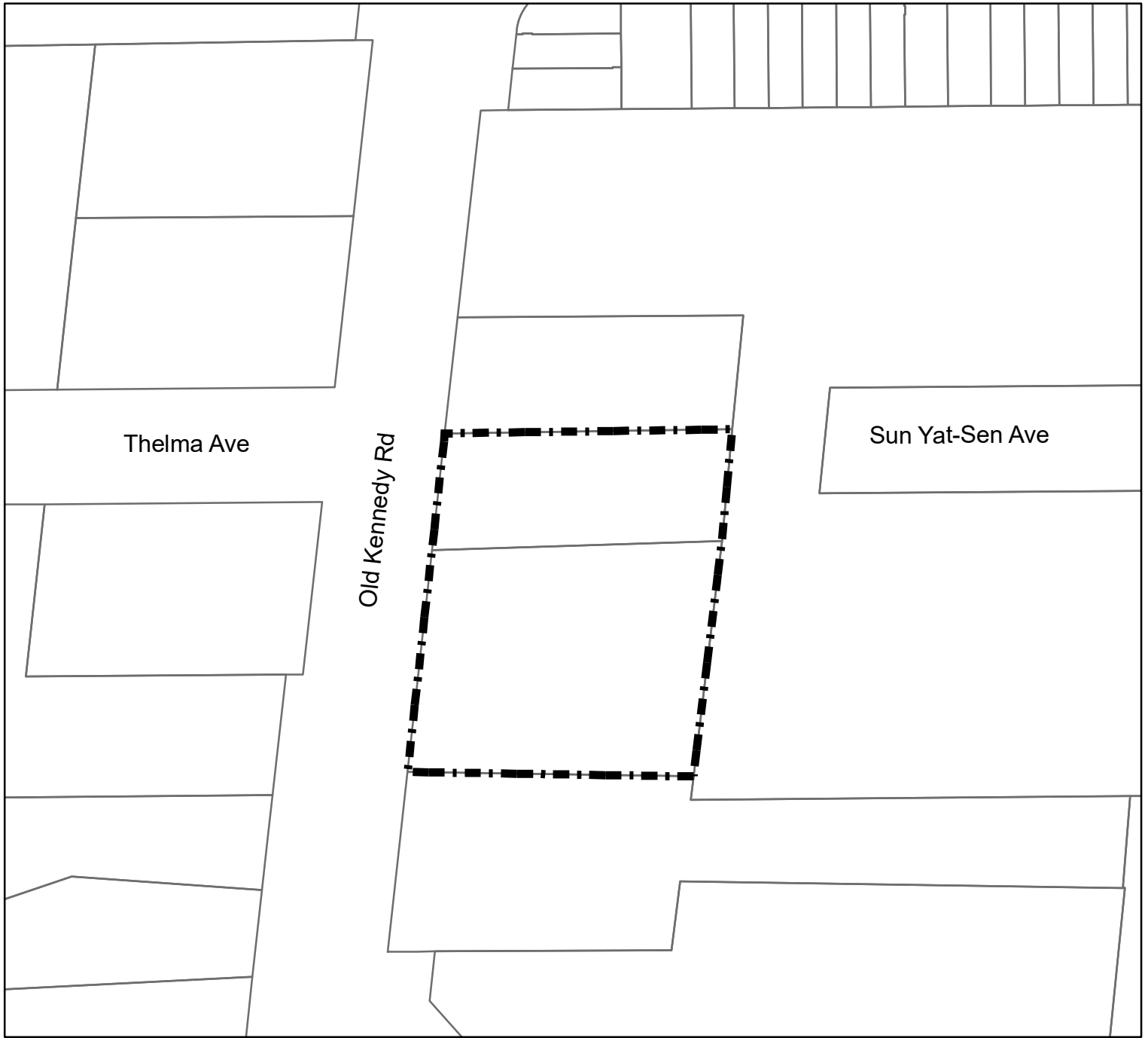
FIGURE 2-4-3 TO THE MAIN STREET MILLIKEN SECONDARY PLAN (PD 2-4)