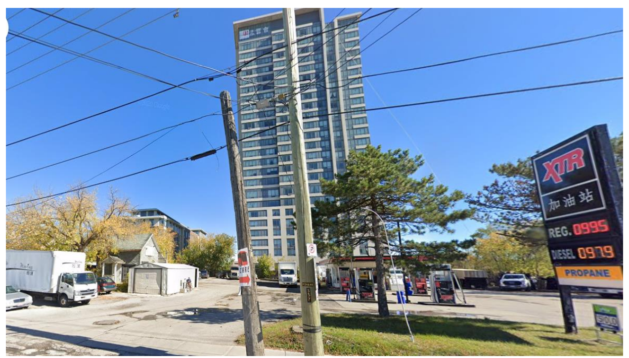
Gas Station with dwelling to the left. Multi-storey residential to the east.

Appendix 'B' Photographs of the Subject Property