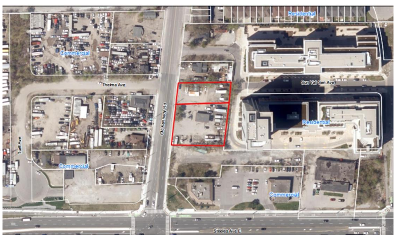
The subject property outlined in red [above] and an aerial image of the subject property [below]