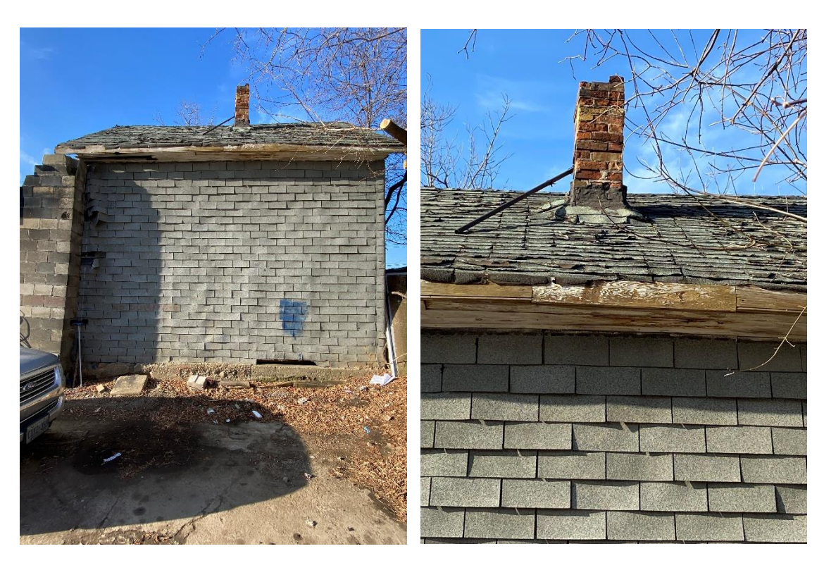
East (Rear) Elevation, November 30, 2023- Site Visit