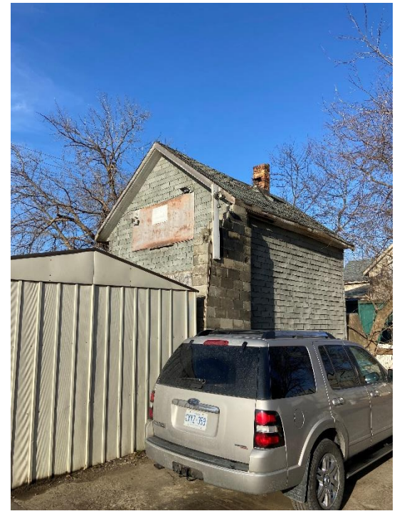
Front (West) Elevation and South Elevation, November 30, 2023- Site Visit