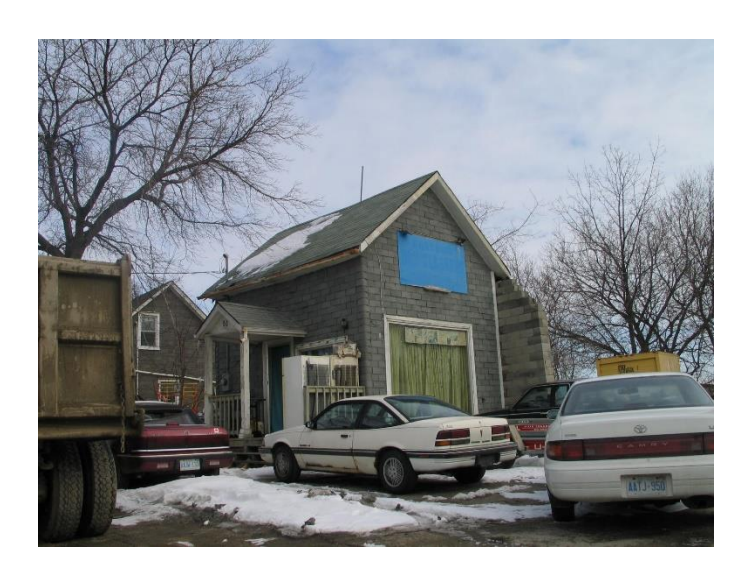
William Prebble House 51 Old Kennedy Road c.1895