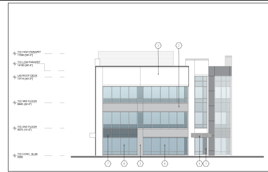
2 EAST ELEVATION A-3.0 1:200