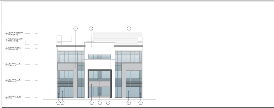
1 WEST ELEVATION A-3.0 1:200