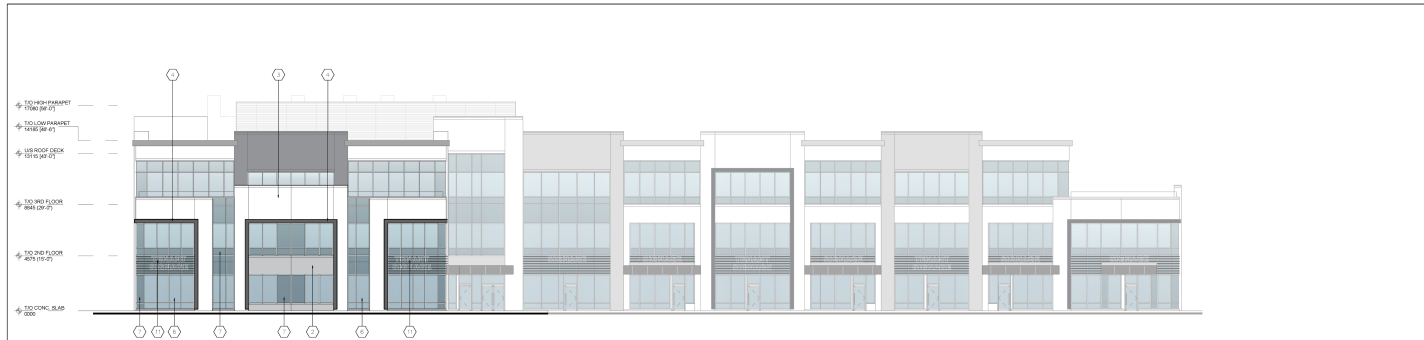
4 SOUTH ELEVATION A-3.0 1:200