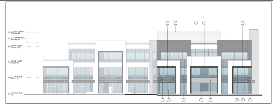
2 EAST ELEVATION A-3.0 1:200