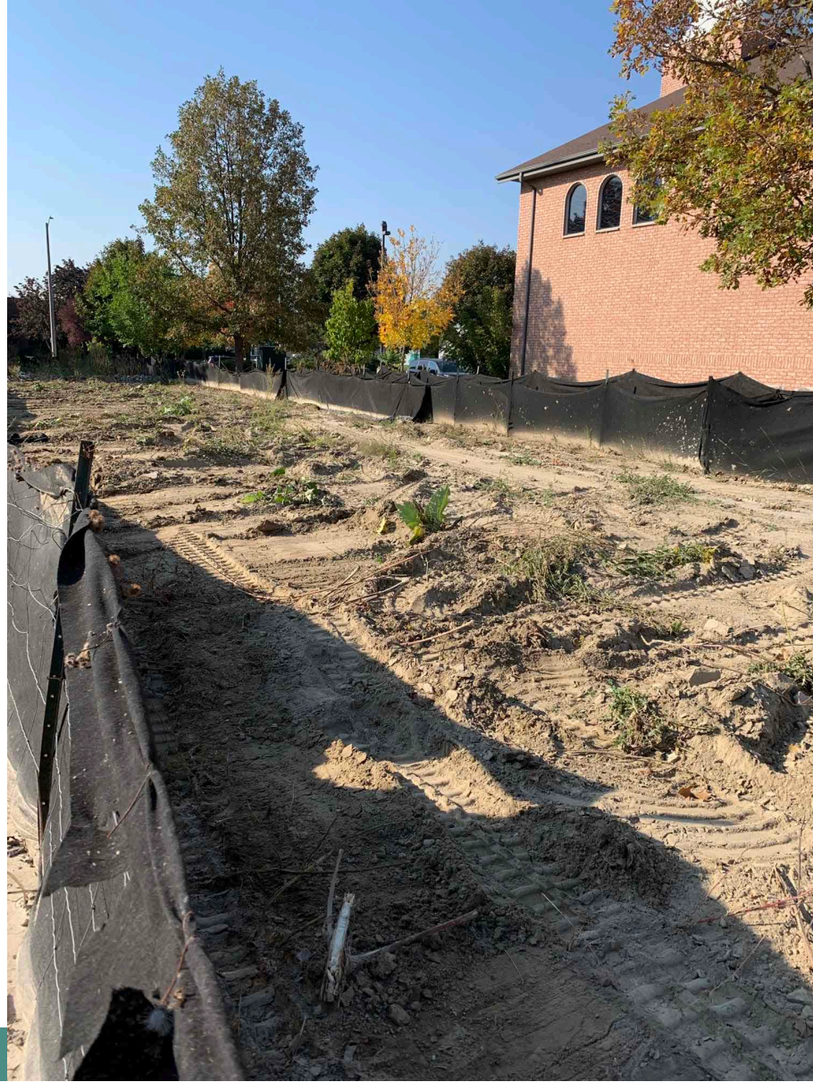
Existing Conditions (Shared Property Line with 2850 John Street)