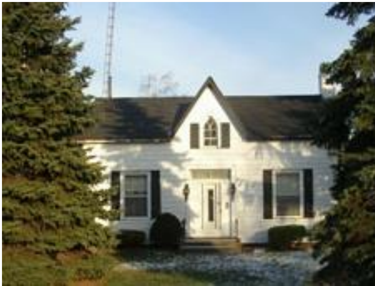
Primary (west) elevation of the heritage resource