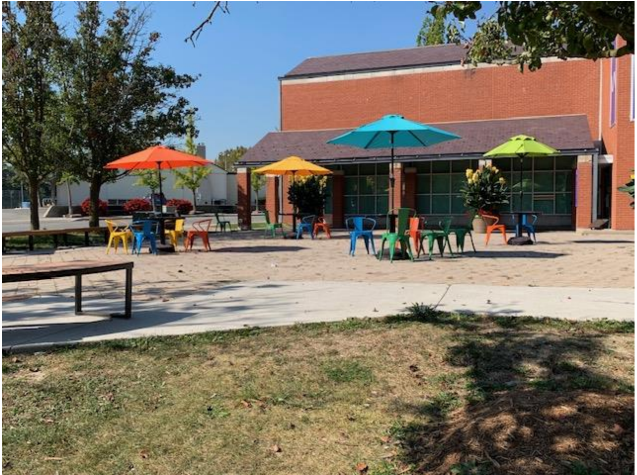
The courtyard as viewed from Main Street showing the seasonal patio furniture