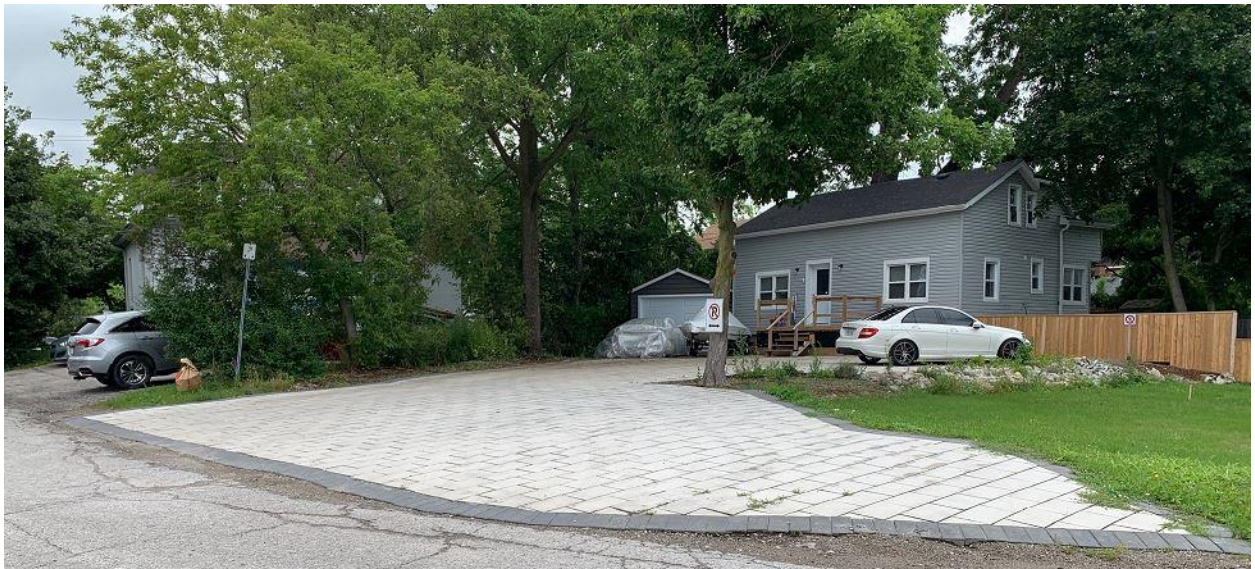
The primary (north) elevation of the Subject Property prior to the unauthorized driveway expansion [above] and after [below]