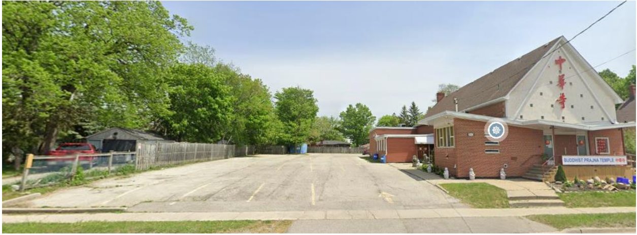
West (Main Street North) showing parking lot and entrance driveway

Image of the Subject Property Prior to Alteration