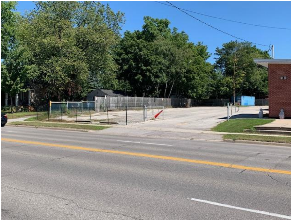
The primary (west) elevation of the Subject Property showing the unauthorized fence installation and new gate feature