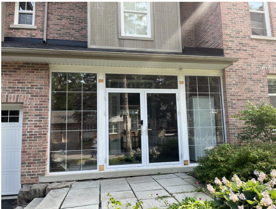
The primary (north) elevation of the Subject Property prior to enclosure of the veranda [above] and after [below]