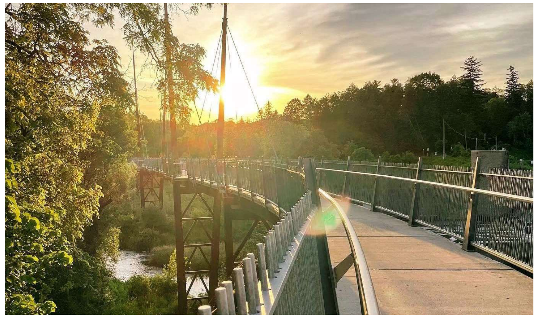
June 27, 2023

Location: Rouge National Urban Park (visitmarkham.ca)