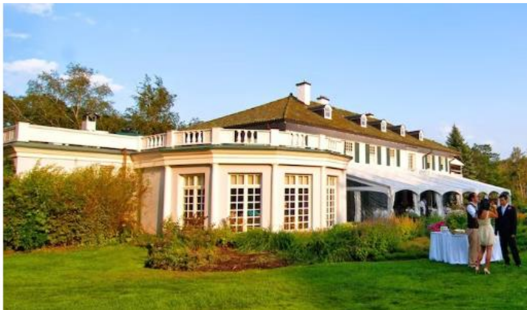
Addition to be removed