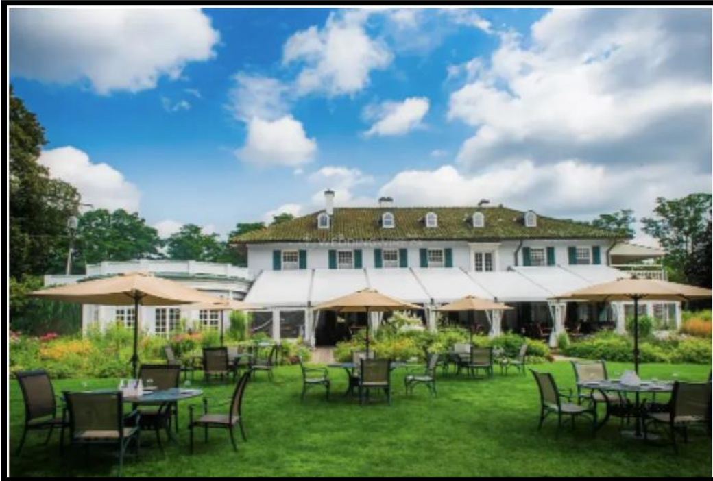
1990 addition on left of main house