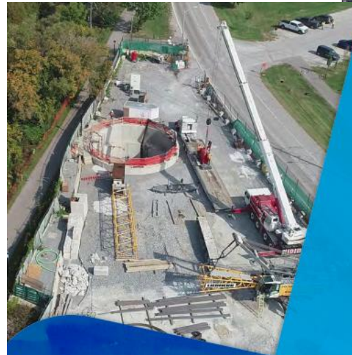
2022 YORK REGION WATER AND WASTEWATER MASTER PLAN AUGUST 2022