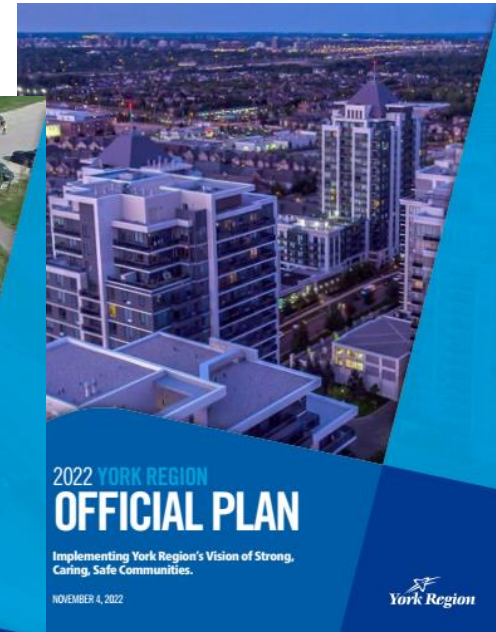
2022 YORK REGION OFFICIAL PLAN

Implementing York Region's Vision of Strong, Caring, Safe Communities.