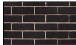
"ESPRESSO" FACE BRICK