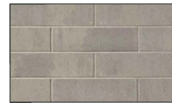
"CLOUD BURST" SMOOTH STONE