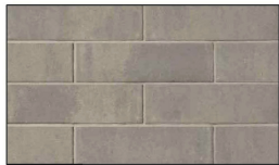
"CLOUDBURST" SMOOTH STONE