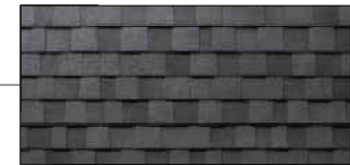
"BARKWOOD" ASPHALT SHINGLES