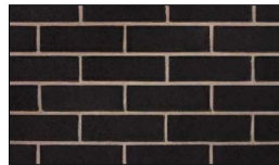
"ESPRESSO" FACE BRICK