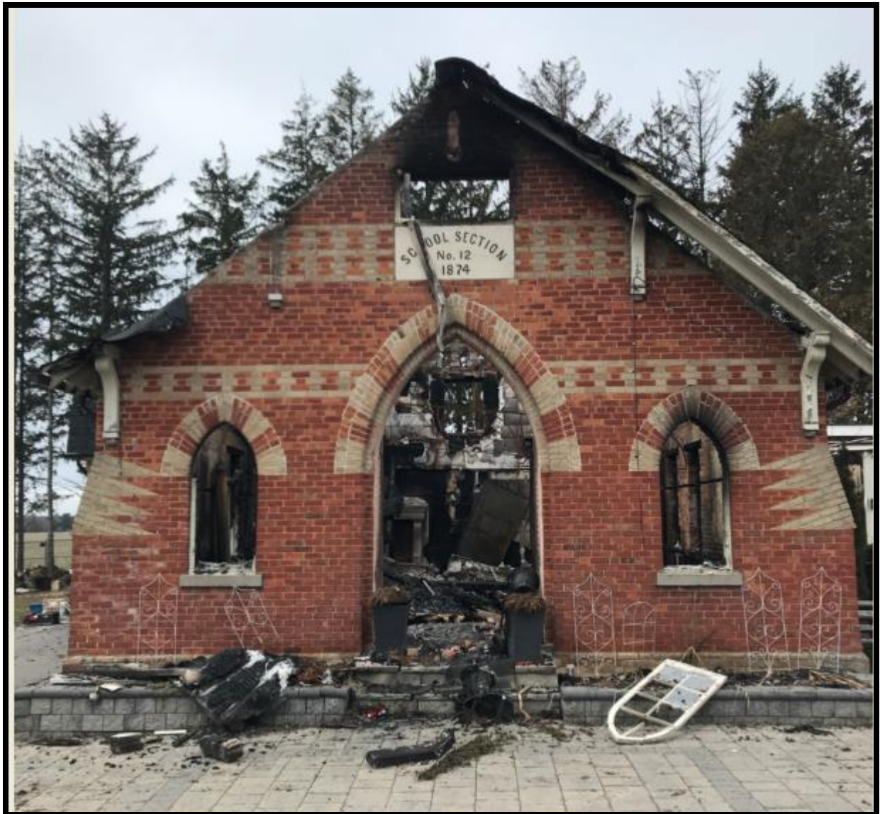
View of East (Primary-Front) Facade