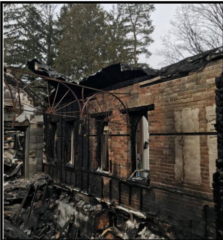
View of interior of north wall