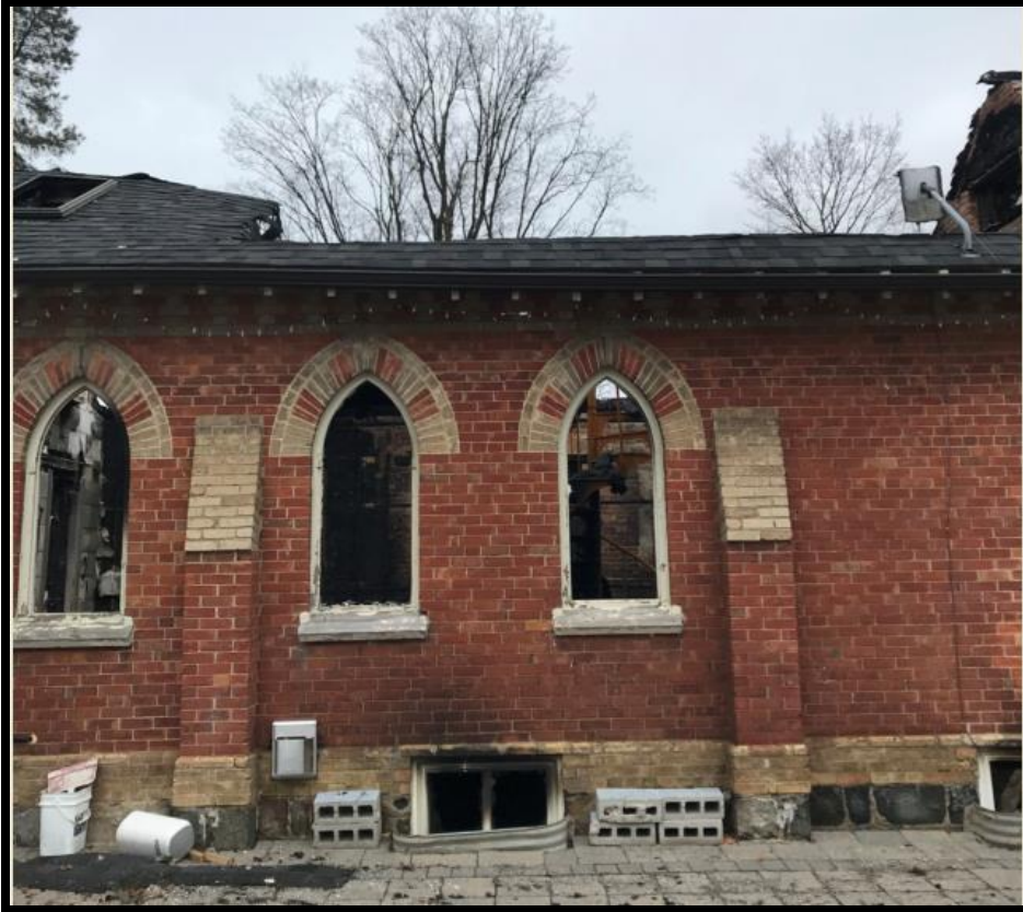
View looking at south wall